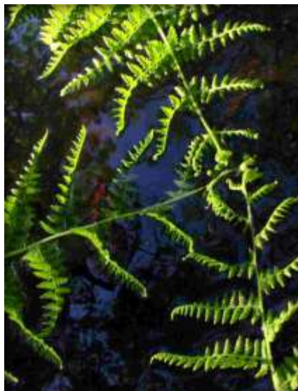
Second Place Fern Earl Cockerham