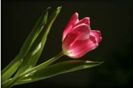
First Place Happy Spring Leslie Patten