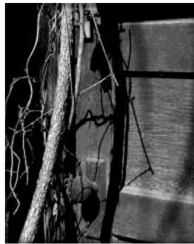
Second Place Shadows of Old Ellen Zimmerman