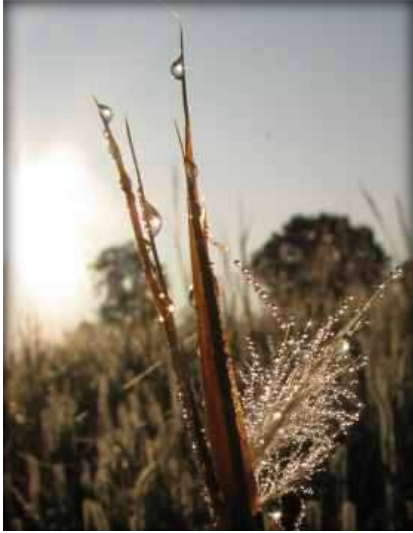
First Place Dew Earl Cockerham