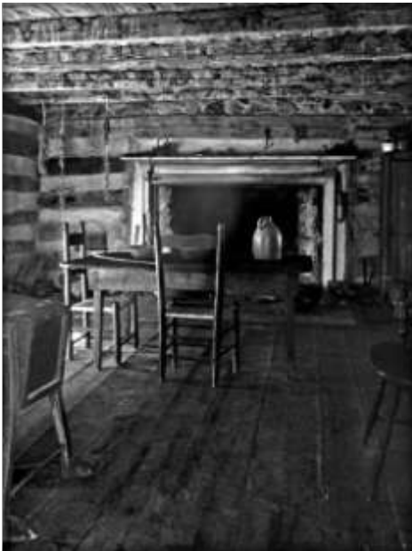
First Place Country Kitchen Karl Mueller