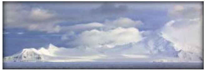
Second Place Antarctic Light/Shadow Carol Carson