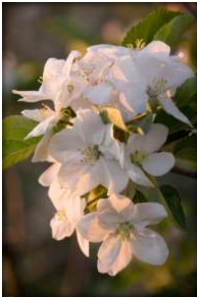
Third Place First Light Cathie Carnahan