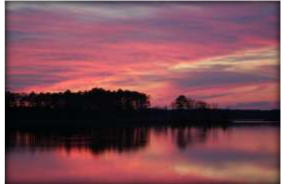
Second Place Chincoteague Sunset Leslie Patten