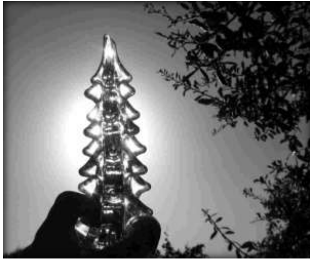
First Place Broken Christmas Earl Cockerham