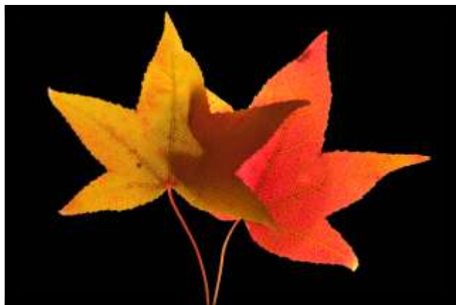
First Place Backlight Cathie Carnahan