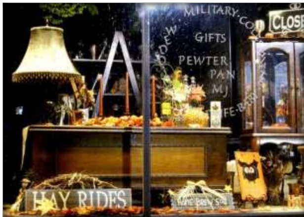
Third Place Store Front Window Winc. Leo Schweiger