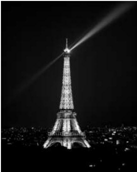
First Place City of Lights Lisa Pinalto