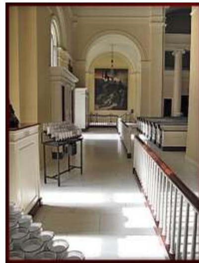
Honorable Mention Basilica of Assumption Leo Schweiger