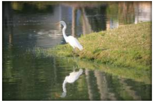
Honorable Mention Low Country Reflection Dave Goff