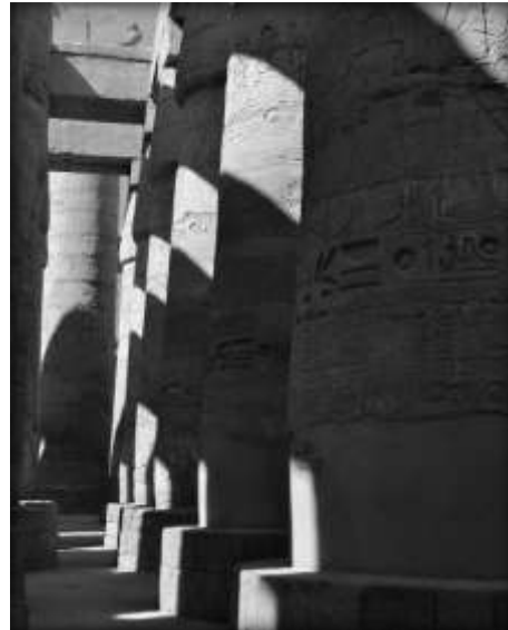
Second Place The Temple Lisa Pinalto