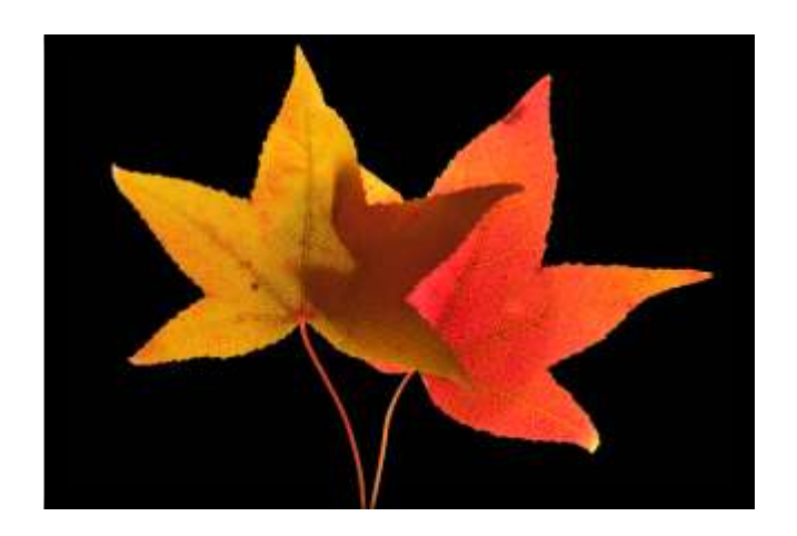
First Place Backlight Cathie Carnahan