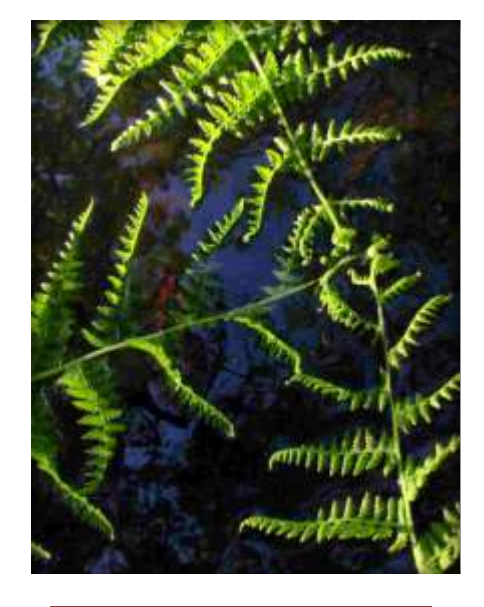
Second Place Fern Earl Cockerham