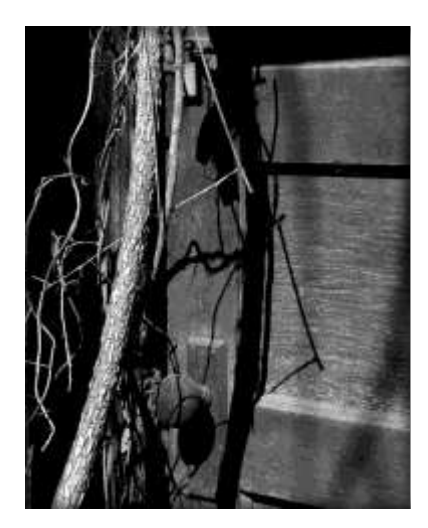
Second Place Shadows of Old Ellen Zimmerman