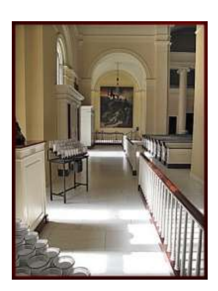
Honorable Mention Basilica of Assumption Leo Schweiger