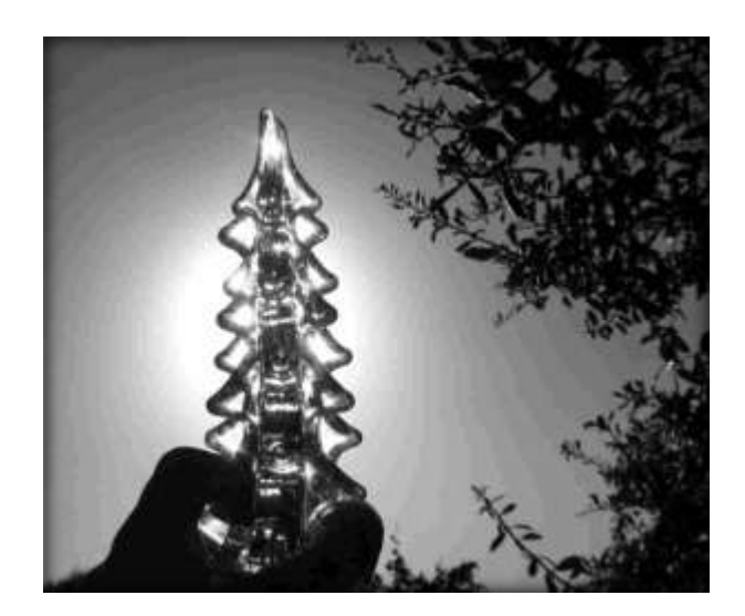
First Place Broken Christmas Earl Cockerham