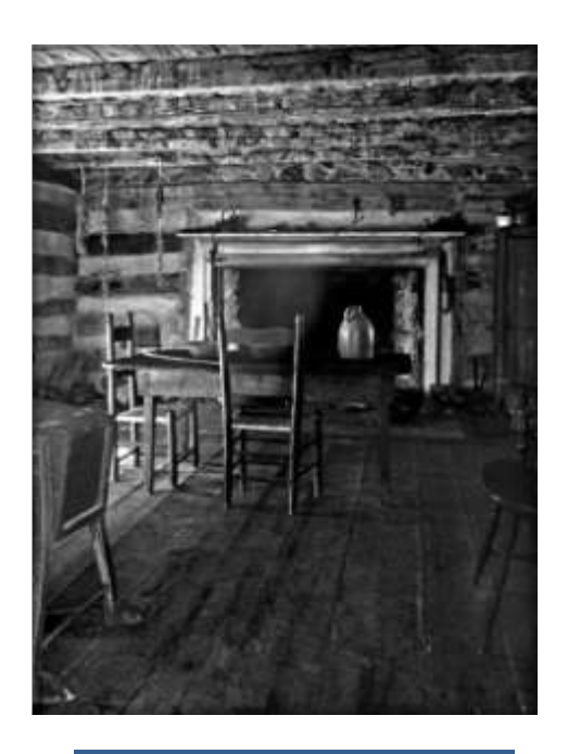
First Place Country Kitchen Karl Mueller