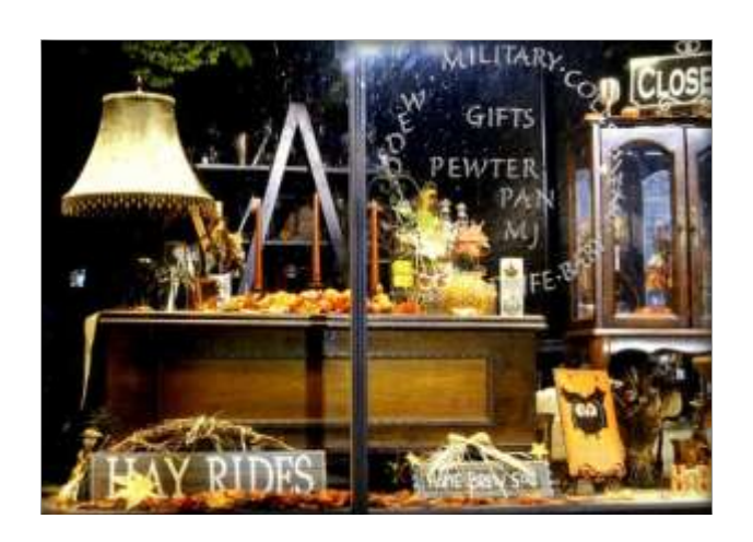
Third Place Store Front Window Winc. Leo Schweiger