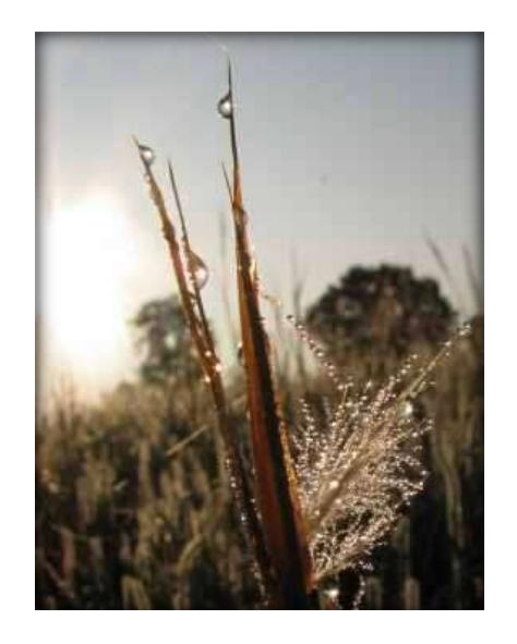
First Place Dew Earl Cockerham