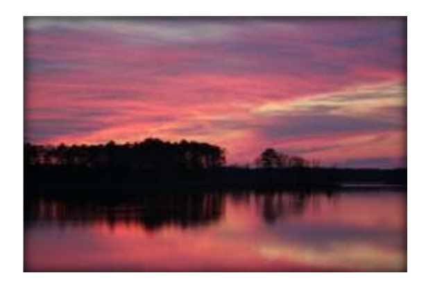
Second Place Chincoteague Sunset Leslie Patten