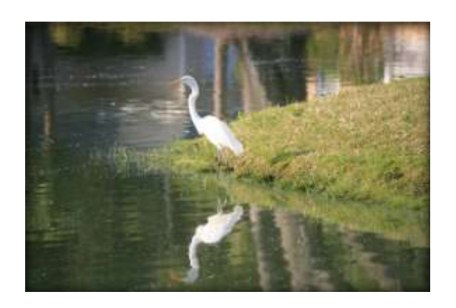
Honorable Mention Low Country Reflection Dave Goff