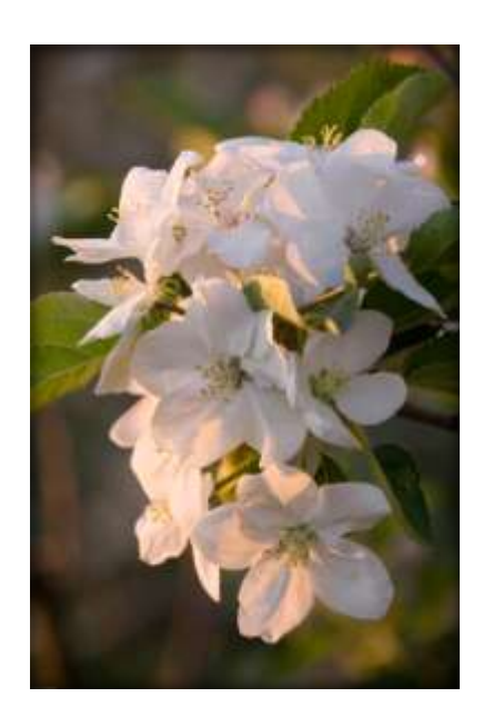
Third Place First Light Cathie Carnahan