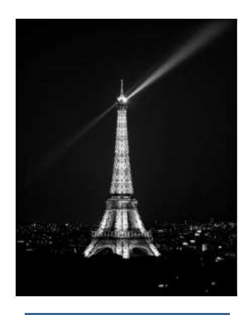
First Place City of Lights Lisa Pianalto