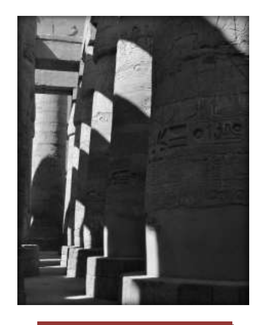
Second Place The Temple Lisa Pianalto