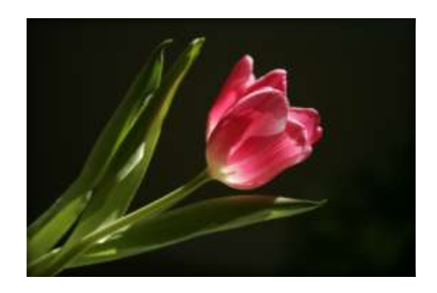
First Place Happy Spring Leslie Patten