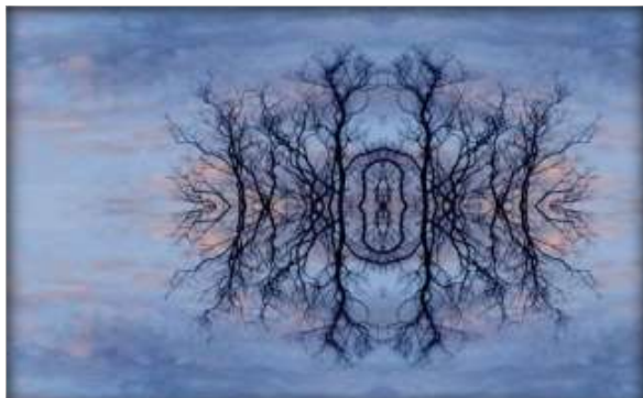
Third Place Persimmon Earl Cockerham