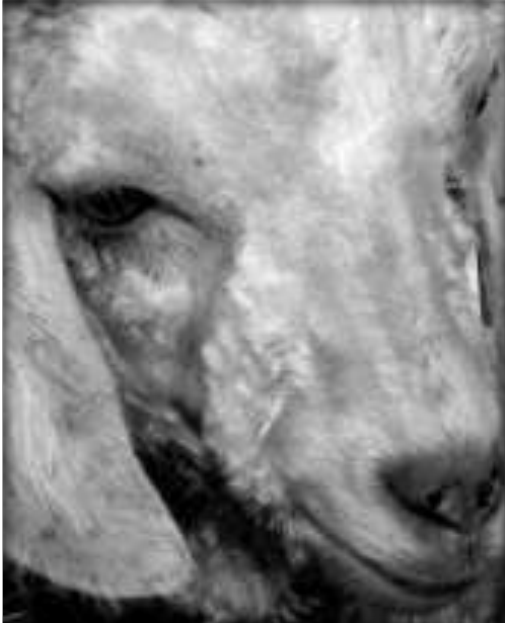
First Place Sad Eye Ellen Zimmerman