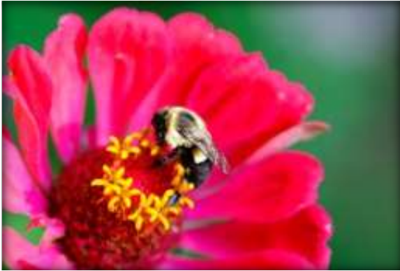
First Place Bee Flower Jim Planck