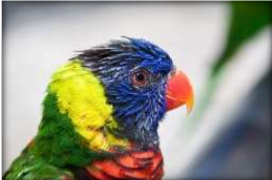
First Place Bird's Eye Cathie Carnahan