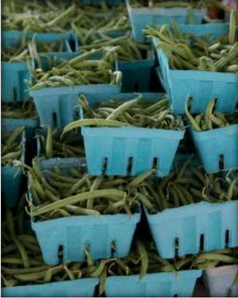
First Place Blue and Green Lisa Pianalto