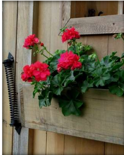
Second Place Country Door Ellen Zimmerman