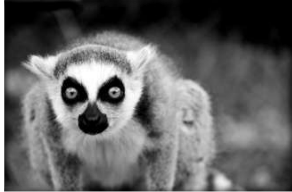
Second Place Evil Eye Cathie Carnahan