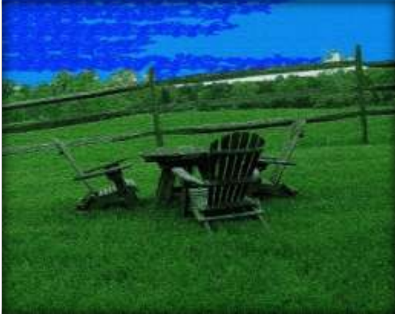
First Place Purely Pastoral Ellen Zimmerman