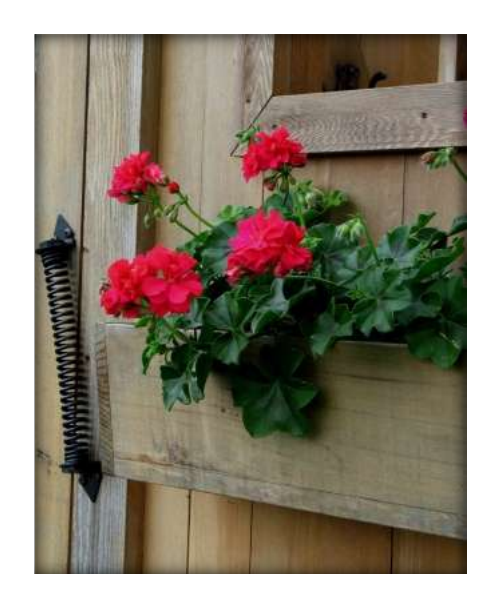
Second Place Country Door Ellen Zimmerman