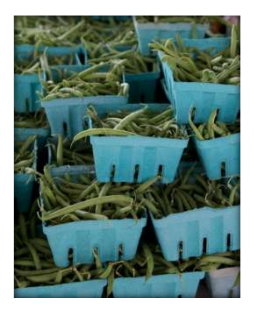
First Place Blue and Green Lisa Pianalto