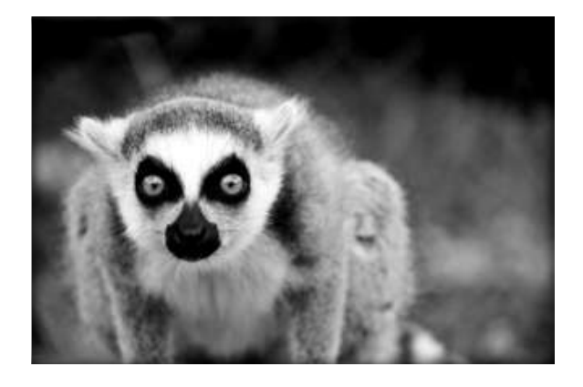
Second Place Evil Eye Cathie Carnahan