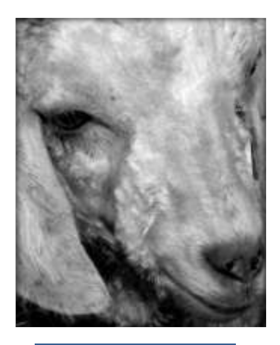
First Place Sad Eye Ellen Zimmerman