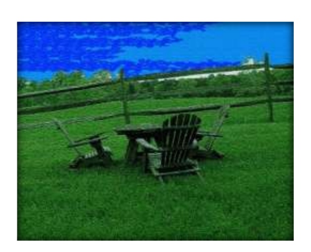
First Place Purely Pastoral Ellen Zimmerman