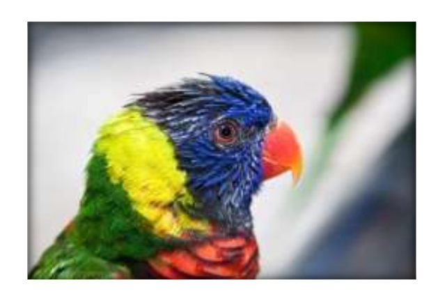
First Place Bird's Eye Cathie Carnahan