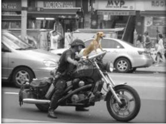
First Place Wild Thing Tanya Barton