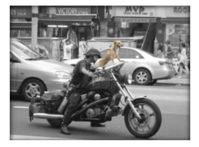
First Place Wild Thing Tanya Barton