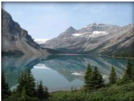
Third Place Bow Reflection Spencer Ridings