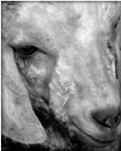
Third Place Sad Eye Ellen Zimmerman