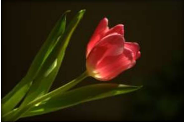
First Place Happy Spring Leslie Patten