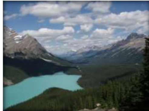
Second Place Turquoise and Blue Spencer Ridings