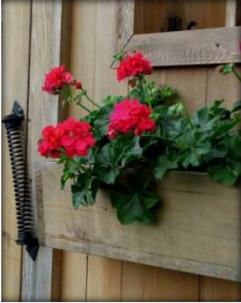
First Place Country Door Ellen Zimmerman