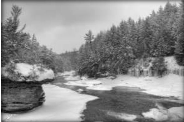
First Place Snow Cathie Carnahan