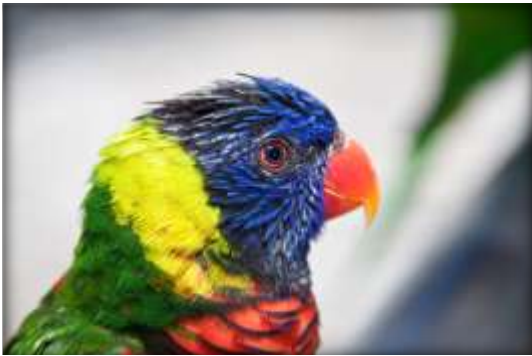
Third Place Bird's Eye Cathie Carnahan