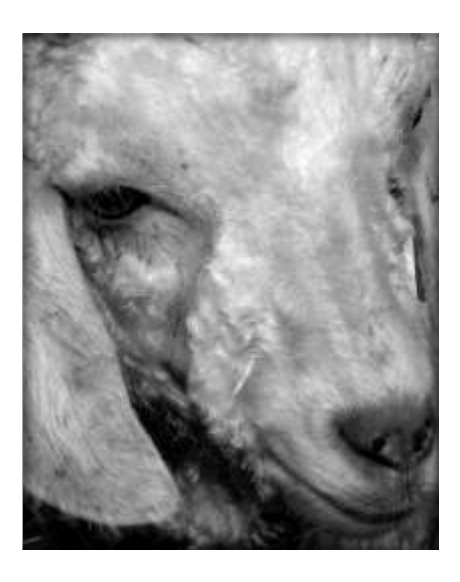
Third Place Sad Eye Ellen Zimmerman