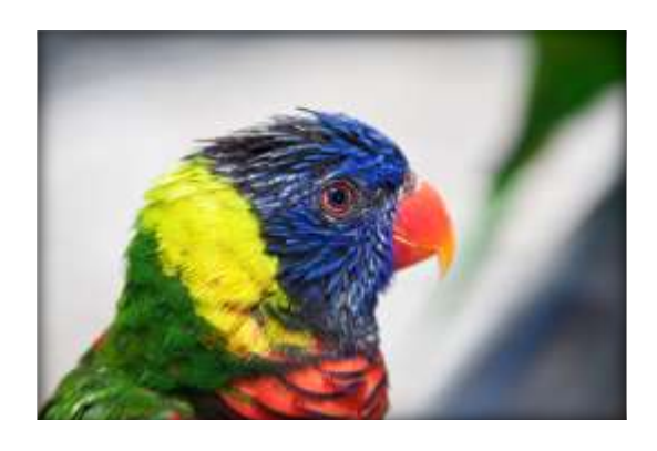
Third Place Bird's Eye Cathie Carnahan