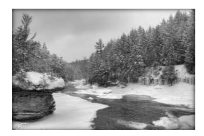
First Place Snow Cathie Carnahan