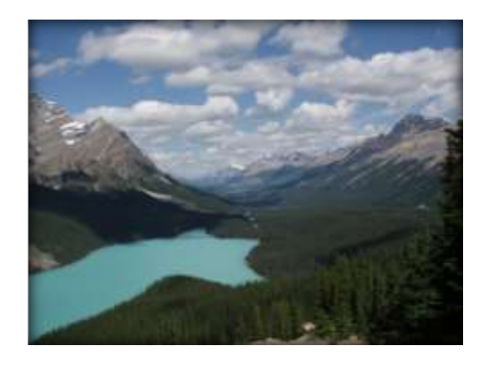
Second Place Turquoise and Blue Spencer Ridings