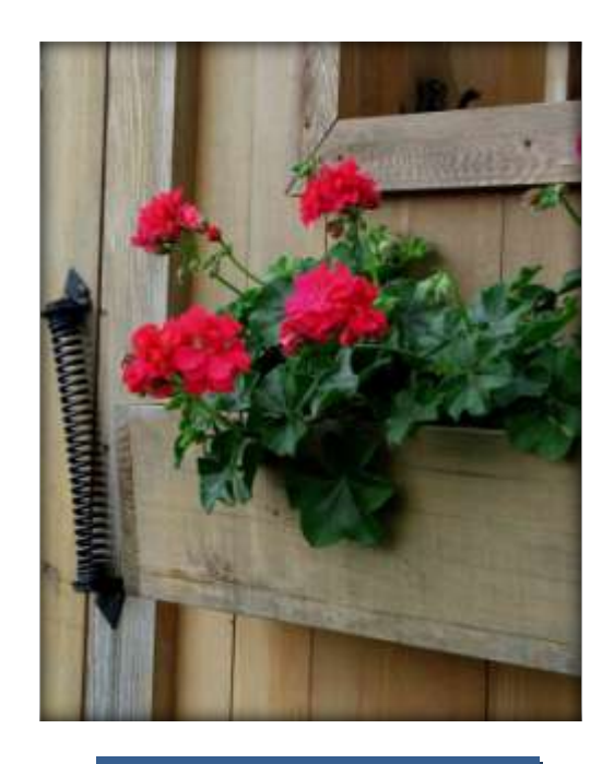
First Place Country Door Ellen Zimmerman