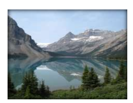
Third Place Bow Reflection Spencer Ridings