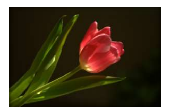
First Place Happy Spring Leslie Patten