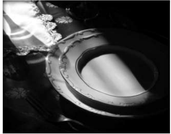
Second Place Holiday China Ellen Zimmerman