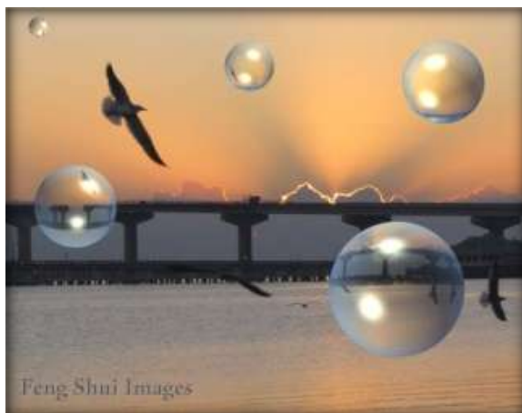
Third Place Sunrise—a New Day Earl Cockerham