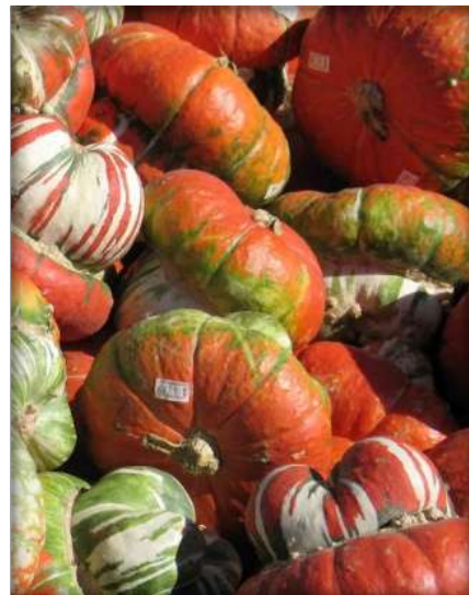
Honorable Mention Must Be Halloween Ellen Zimmerman