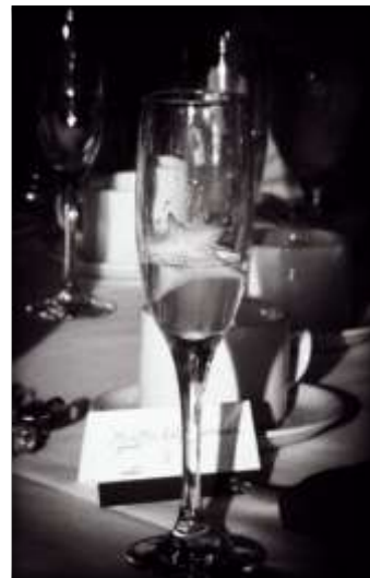
Honorable Mention Temporary Stars Cathie Carnahan