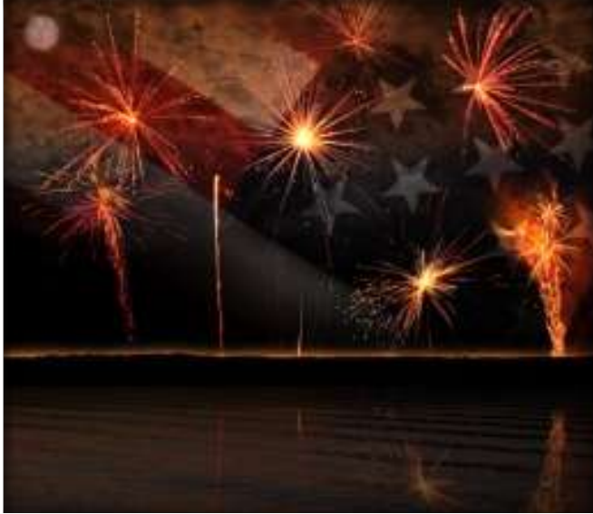
First Place Independence Erik Zimmerman