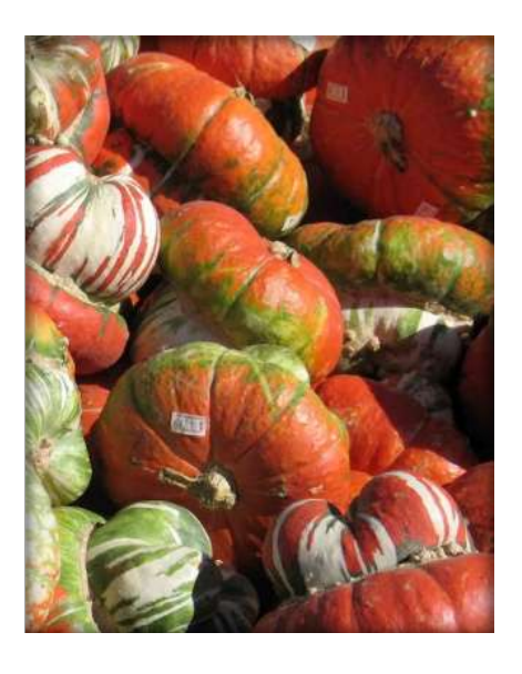
Honorable Mention Must Be Halloween Ellen Zimmerman