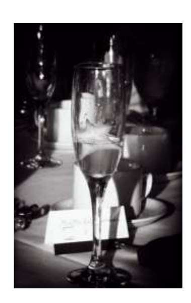
Honorable Mention Temporary Stars Cathie Carnahan