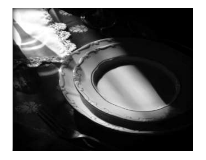
Second Place Holiday China Ellen Zimmerman