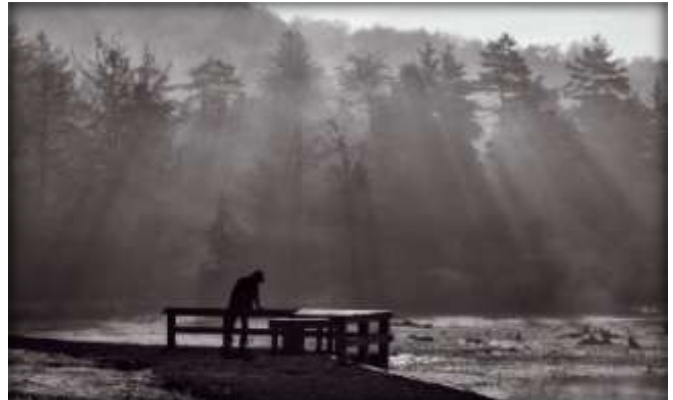
Second Place First Light Cathie Carnahan