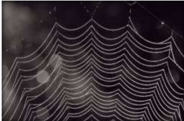
First Place Web Cathie Carnahan