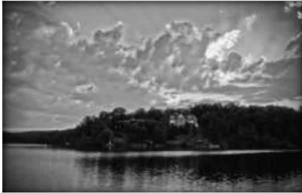
First Place Lake Sunset Erik Zimmerman