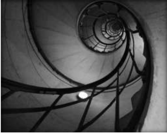
First Place Up Lisa Pinalto