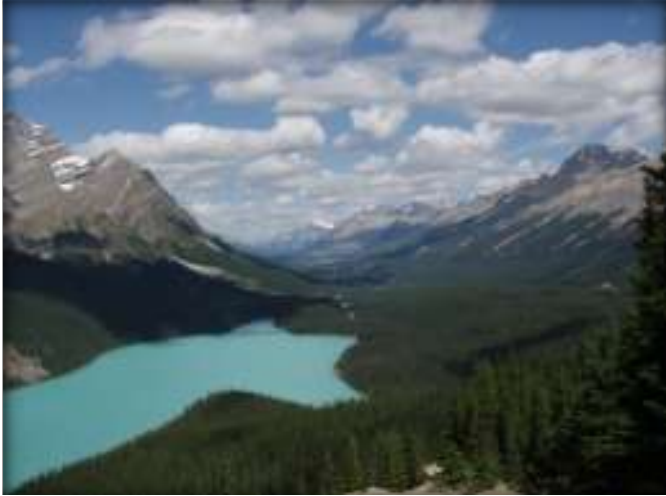
First Place Turquoise and Blue Spencer Ridings