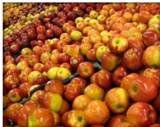
Honorable Mention Autumn Apples Tanya Barton