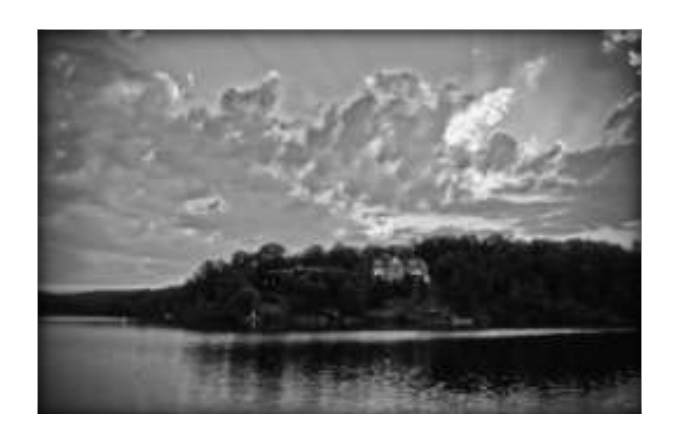
First Place Lake Sunset Erik Zimmerman