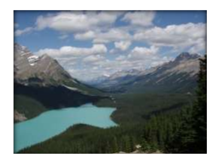
First Place Turquoise and Blue Spencer Ridings