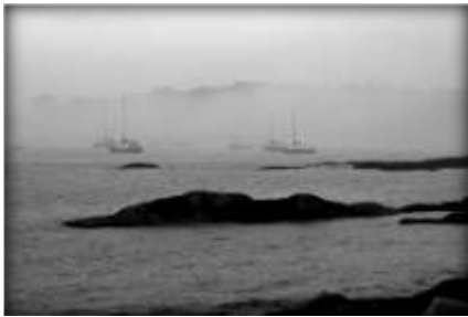
Third Place No Sailing Today Chet Lewandowski