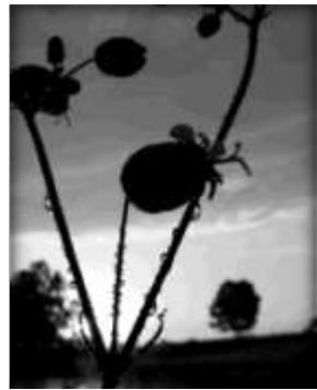
Honorable Mention Water Drops Earl Cockerham