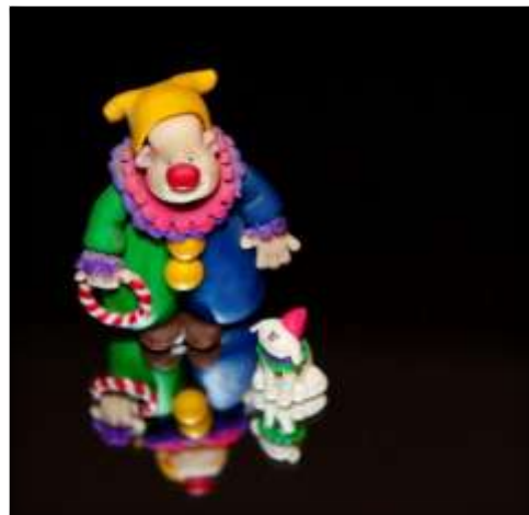
Honorable Mention Colorful Playtime Tanya Barton