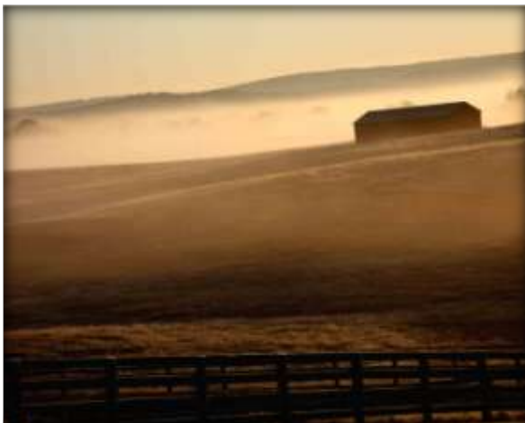
Third Place Foggy Morning Ellen Zimmerman