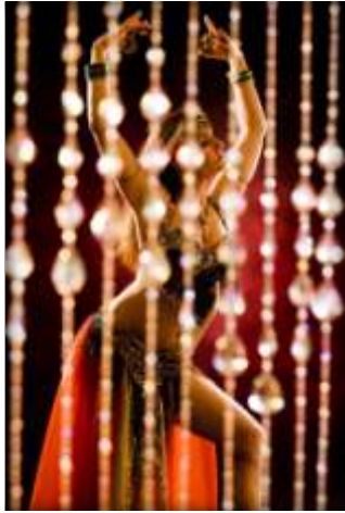
First Place Untitled 2 Bob Peak