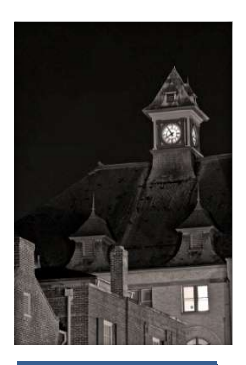
First Place Working Late Chet Lewandowski