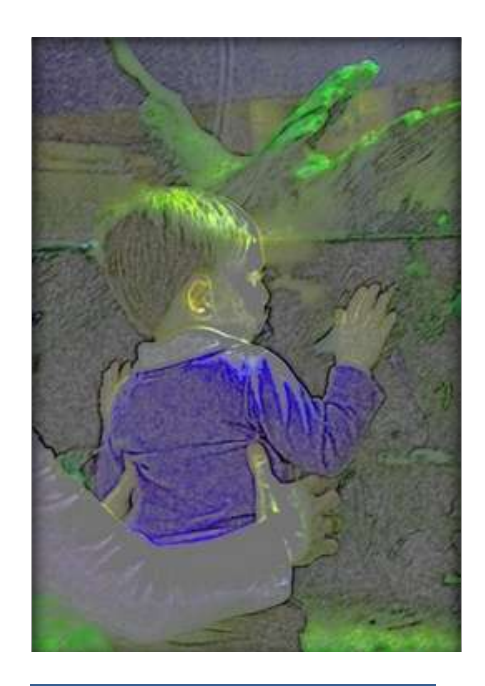
First Place At the Aquarium Kristin Zimet