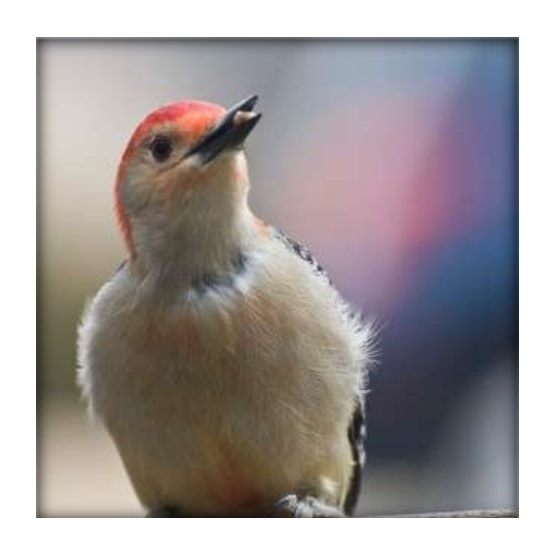
Honorable Mention Woodpecker Cynthia Winter