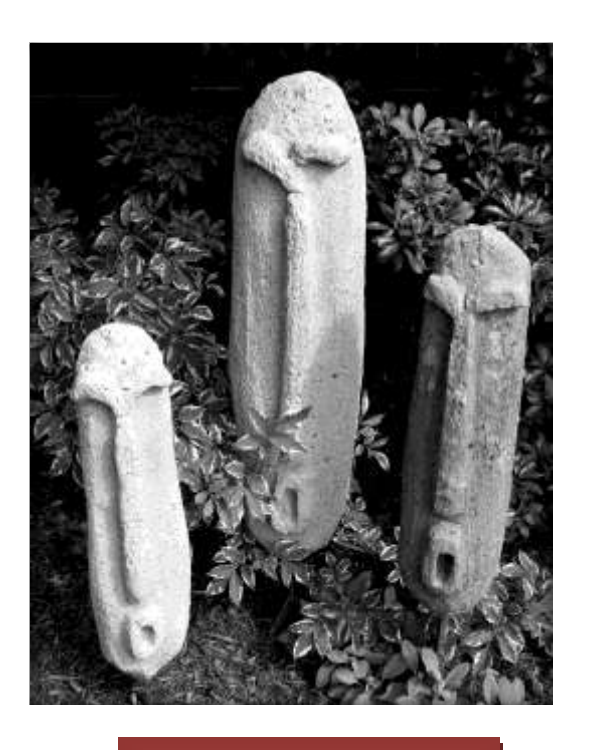
Second Place Silent Voices Ellen Zimmerman