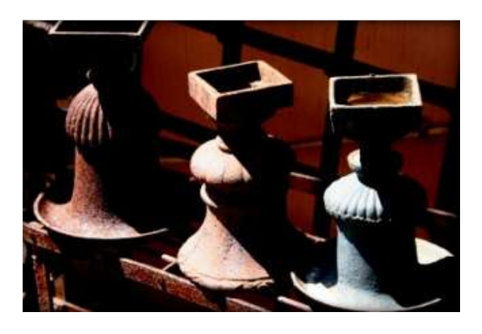
Honorable Mention The Same But Different Liz Browning