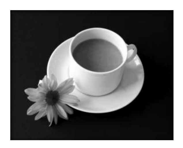
Honorable Mention Simply Cocoa Ellen Zimmerman