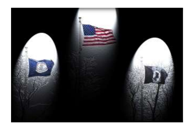
Honorable Mention Freedom Sandra Ashton