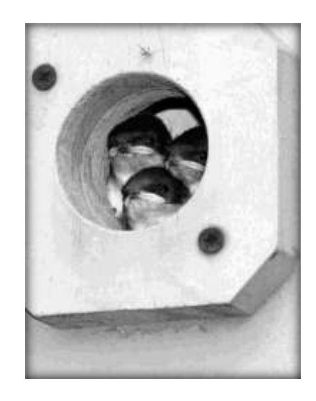
Second Place Family Carl Cockerham