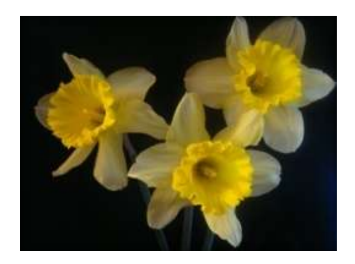
First Place 3 Daffs Laura Patten