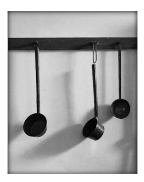
Third Place Antique Ladles Jim Planck