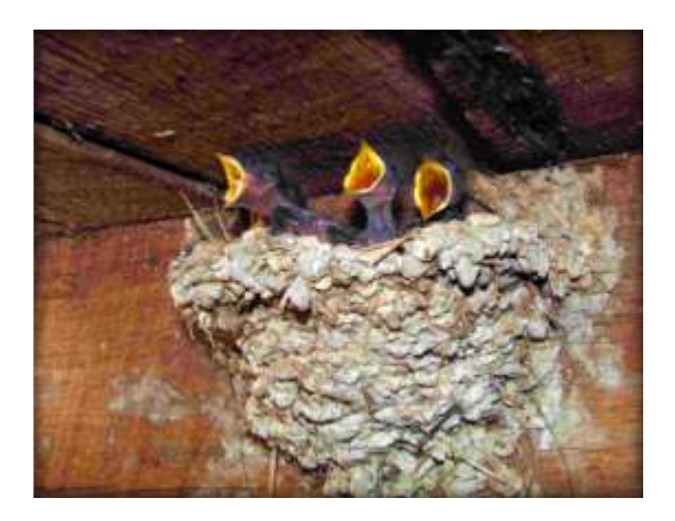
First Place Feed Me Earl Cockerham