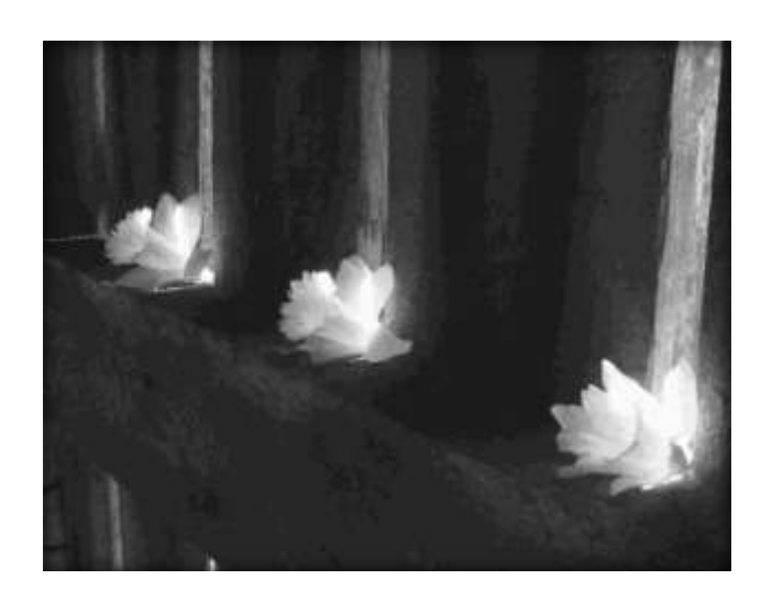
First Place Barn Earl Cockerham