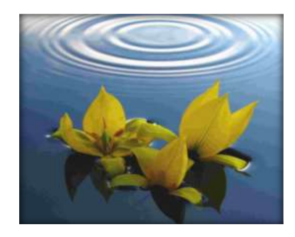
Second Place Lily Earl Cockerham