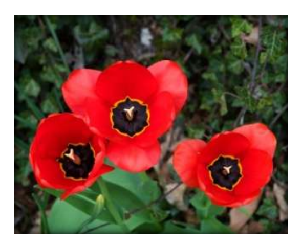
Second Place 3 Tulips Mike Potter