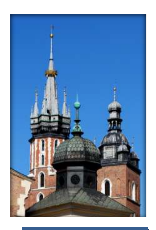
First Place Three Towers Chet Lewandowski