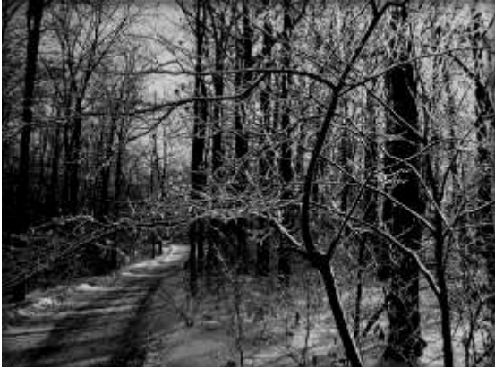
First Place Winter Weather Sandra Ashton