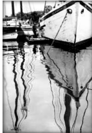
Second Place Adventure Jim Planck