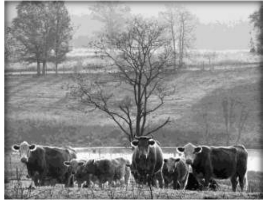
Second Place Cows Earl Cockerham