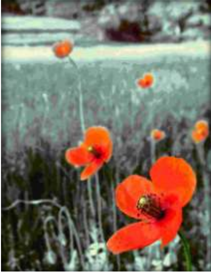
First Place Corn Poppy Earl Cockerham