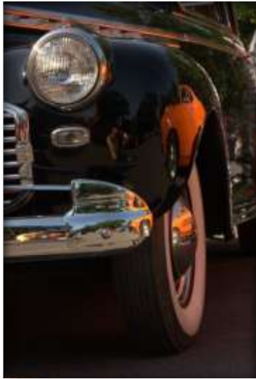
First Place Special Deluxe Chevy Leo Schweiger