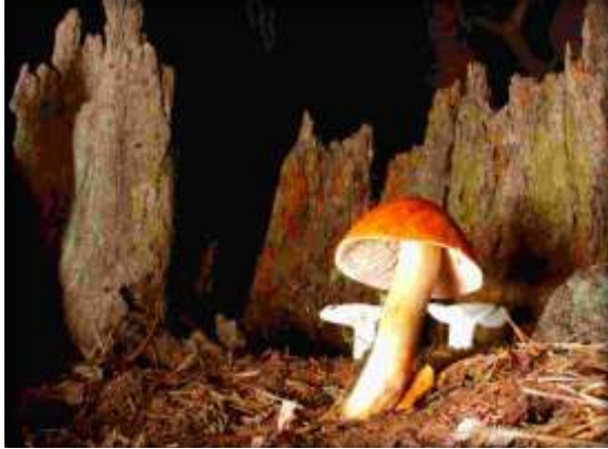
First Place Mushroom Earl Cockerham