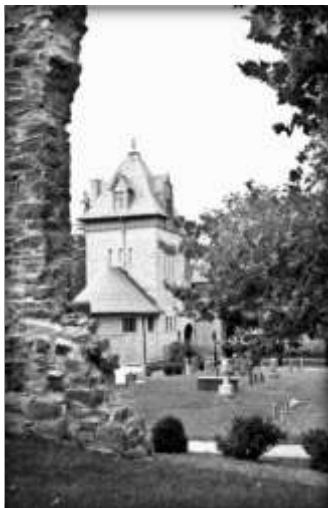
Third Place Monument Detail Mt. Hebron Leo Schweiger