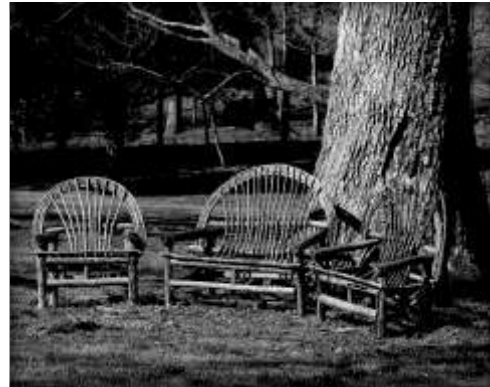
Second Place Under the Tree Ellen Zimmerman