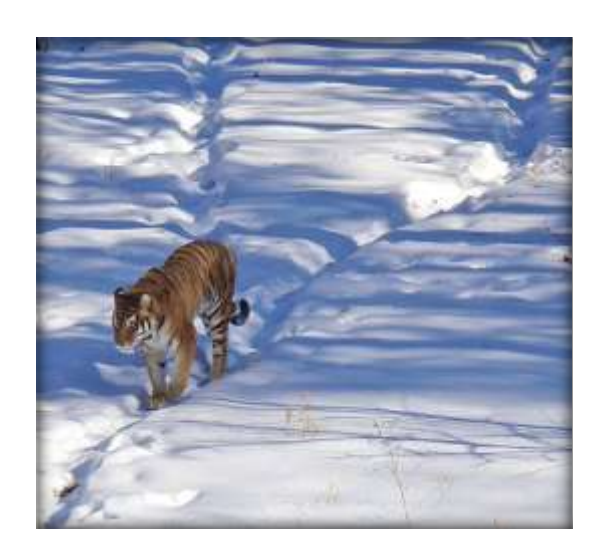
First Place Stripes Kristin Zimet