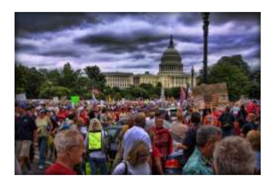
Third Place Hd 9-12 Cathy Carnahan