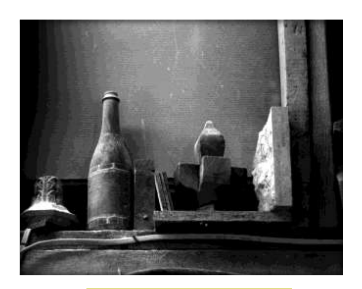
Third Place Forgotten Corner Ellen Zimmerman