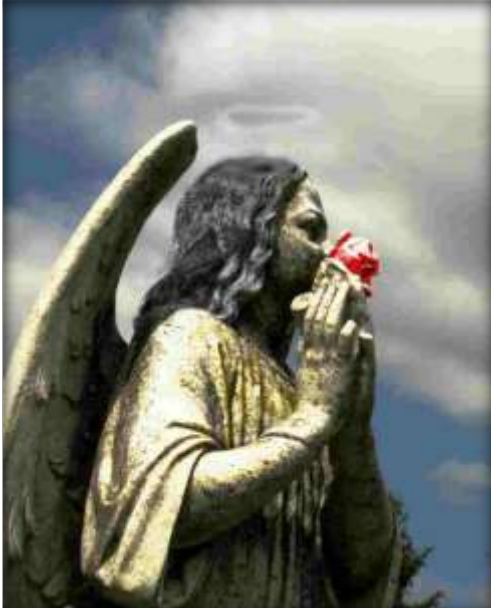
First Place Praying for Healthcare Earl Cockerham