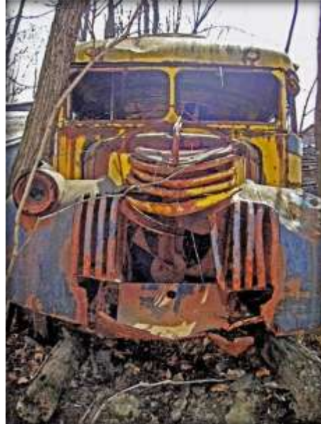
Second Place The Old Bus Kristin Zimet