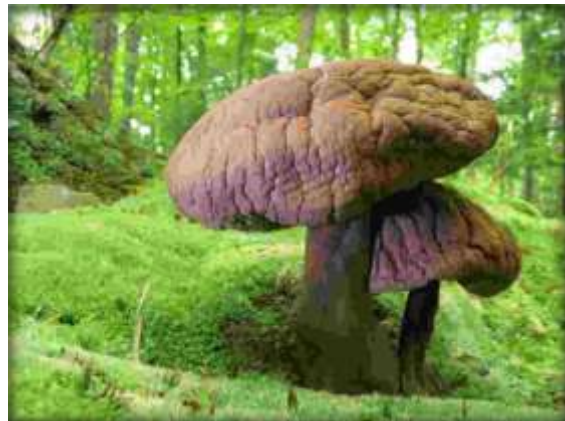
Honorable Mention Growing Old Together Earl Cockerham