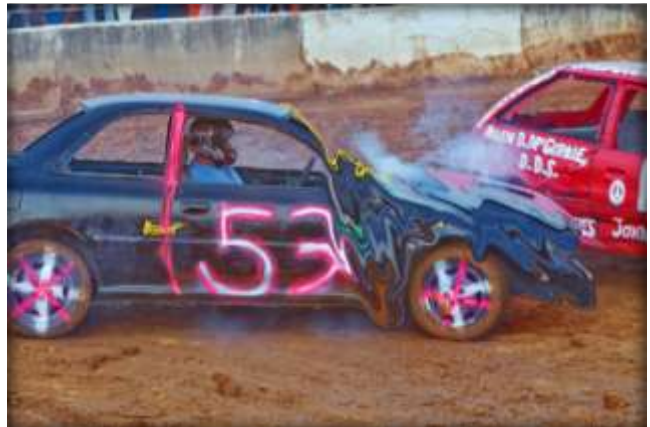
Honorable Mention Hot Car Chet Lewandowski