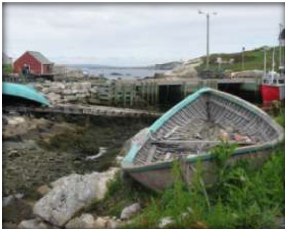
Third Place Deserted Melissa Lease