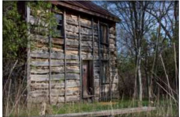
Second Place Nice House Zita Winzer