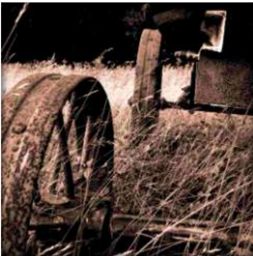
Third Place Curt's Wagon, Sepia Earl Cockerham