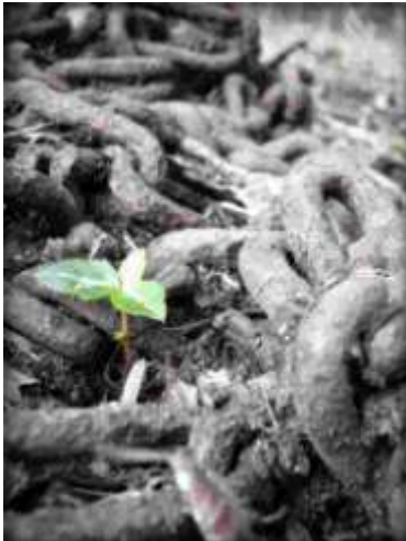
Third Place Chains Earl Cockerham