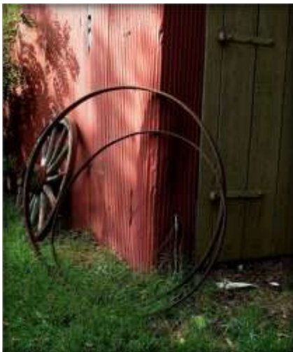
Third Place Forgotten Corner Ellen Zimmerman