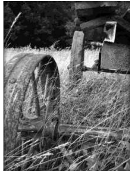
Honorable Mention Rusty Wheels Earl Cockerham