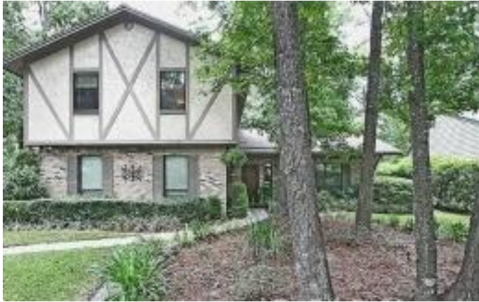
Typical Picture Of Home.