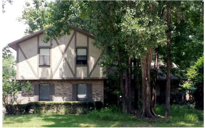
Same House. Better Picture.