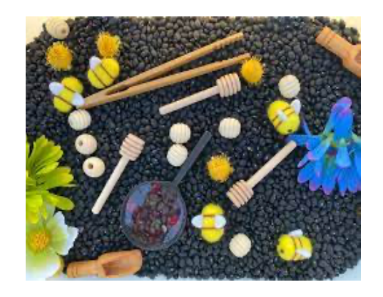
"Play is the work of Childhood" -Jean Paiget