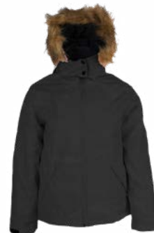
23-3202-J YOUTH (8-18) 23-3202-P KIDS (4-7) 23-3202-T TODDLER (2-4T)