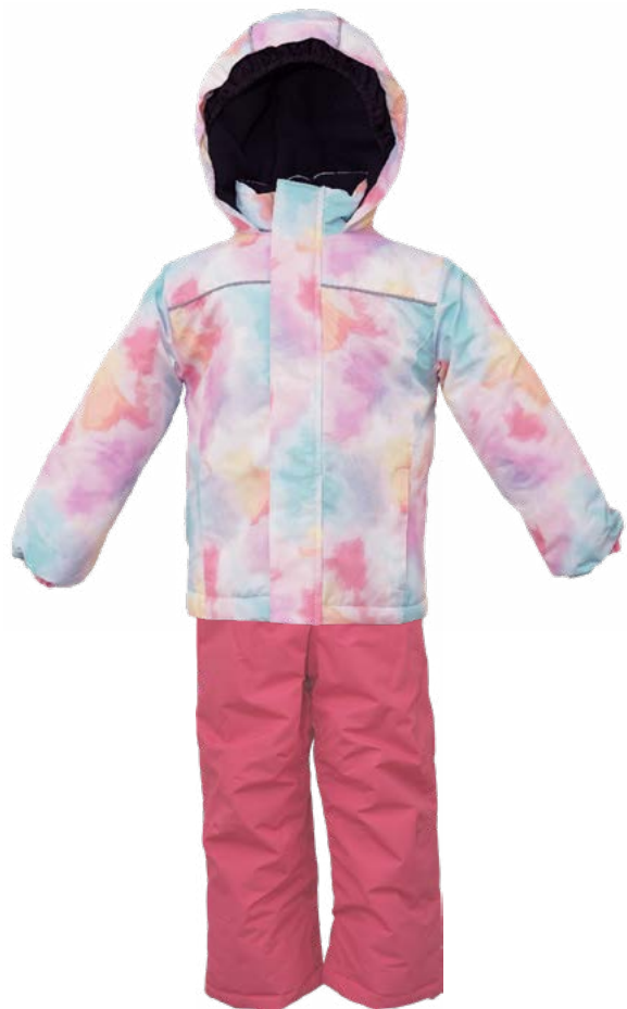
SNOWDAY SET 23-93223-P KIDS (4-7) 23-93223-T TODDLER (2-4T)