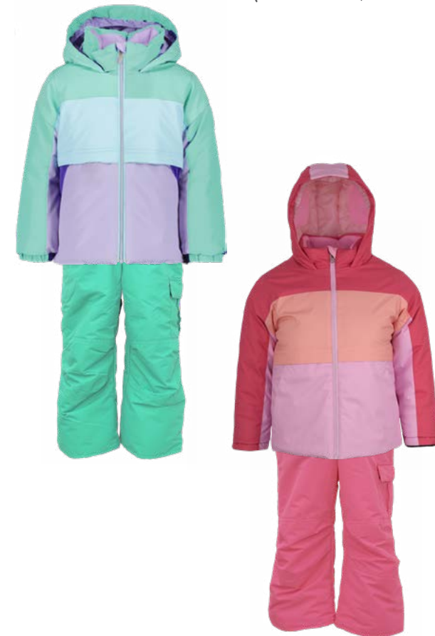
23-93204-P KIDS (4-7) 23-93204-T TODDLER (2-4T)