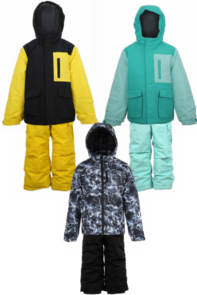
PATCH SET 23-9410-P KIDS (4-7) 23-9410-T TODDLER (2-4T)