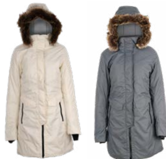
HIGHLAND 23-2243 INSULATED LONG JACKET