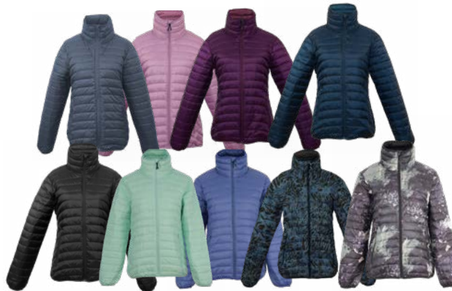
POWDERDOWN 23-2231 PACKABLE 90/10 DUCK DOWN JACKET