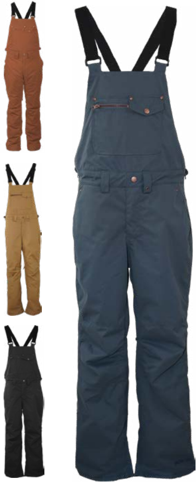
THE DUNGAREE 23-5191-J YOUTH (8-18) INSULATED SNOW COVERALL