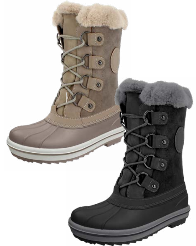
SNOW-SIENNA2-WB // Women Boot SIZE (5-10)