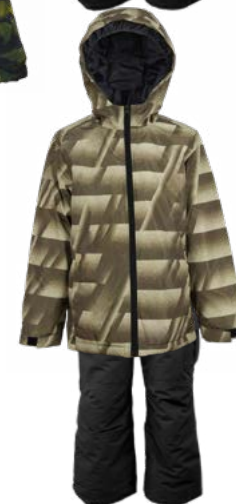
23-9408-P KIDS (4-7) 23-9408-T TODDLER (2-4T)