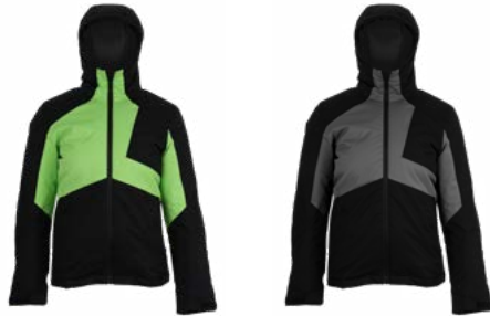
23-404-J YOUTH (8-18) 23-404-P KIDS (4-7) 23-404-T TODDLER (2-4T)