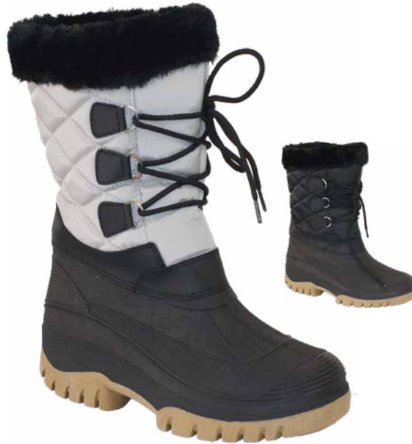
SNOWFB-WB // Womens Boot SIZE (5-10) SNOWFB-YB // Girls Boot by SIZE (13-6)