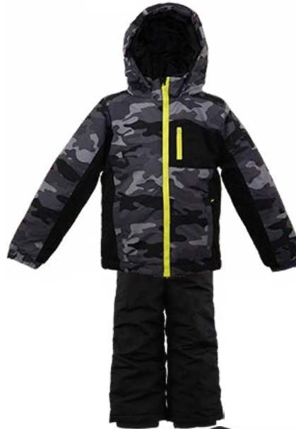
GRAVITY SET 23-94112-P KIDS (4-7) 23-94112-T TODDLER (2-4T)