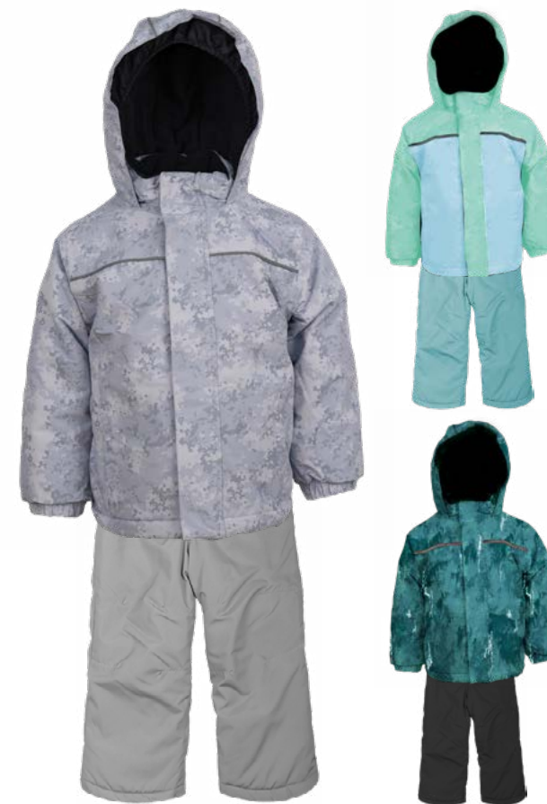
POWER SET 23-9422-P KIDS (4-7) 23-9422-T TODDLER (2-4T)