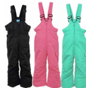
1 2 3