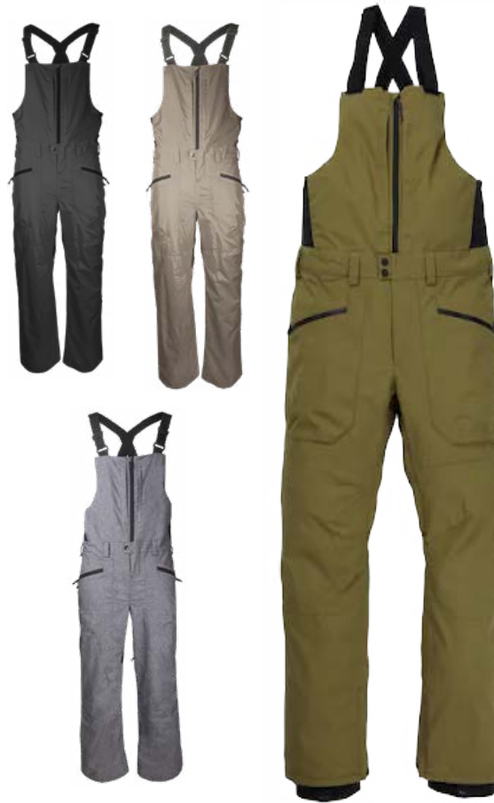
TOP SHELF BIB 23-5192-J YOUTH (8-18) INSULATED STRETCH PANEL BIB