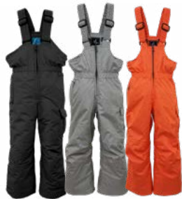
1 2 3