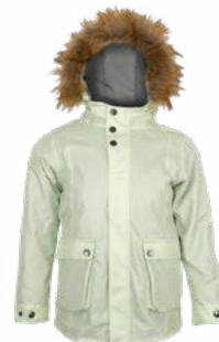
23-3205-J YOUTH (8-18) 23-3205-P KIDS (4-7) 23-3205-T TODDLER (2-4T)