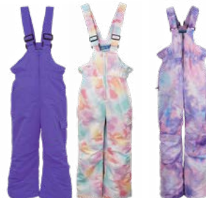
4 5 6