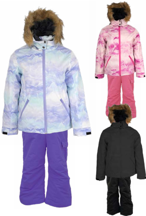
23-93202-P KIDS (4-7) 23-93202-T TODDLER (2-4T)