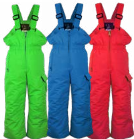
4 5 6