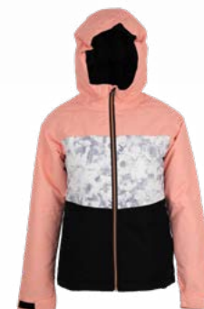
23-3206-J YOUTH (8-18)