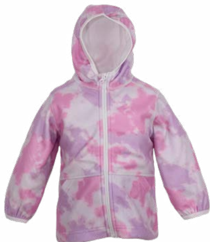
23-3212-HD-J YOUTH (8-18) 23-3212-HD-P KIDS (4-7) 23-3212-HD-T TODDLER (2-4T)