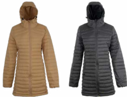
ANDES PARKA 23-2255 SYNTHETIC DOWN STRETCH PARKA