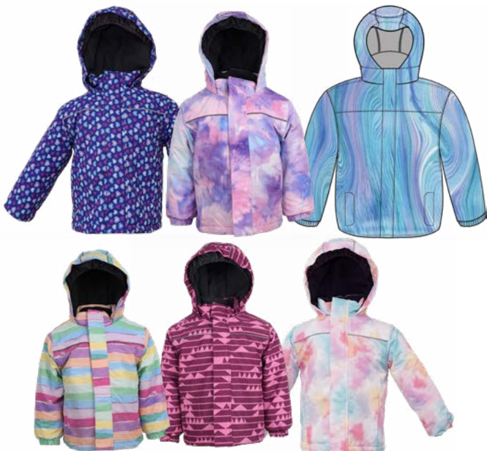
23-3220-J YOUTH (8-18) 23-3220-P KIDS (4-7) 23-3220-T TODDLER (2-4T)