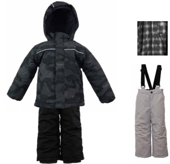
BOY'S EDGE SET 23-94223-P KIDS (4-7) 23-94223-T TODDLER (2-4T)