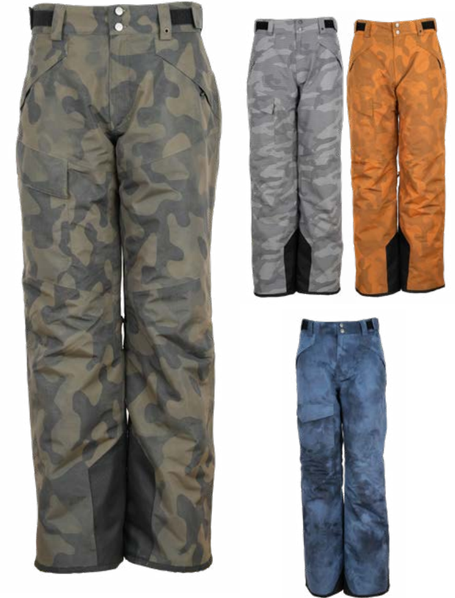
STATEMENT PANT 23-5196-J YOUTH (8-18) PRINTED INSULATED SNOW PANT