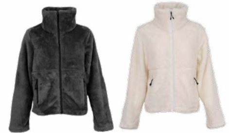
LODGE FLEECE NS-1585 PLUSH CORAL FLEECE JACKET