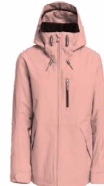
PADDINGTON 23-2244 INSULATED BOARD JACKET