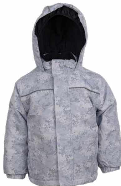
23-423-J YOUTH (8-18) 23-423-P KIDS (4-7) 23-423-T TODDLER (2-4T)