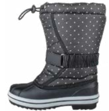
SNOW-BUTTE-YB // Youth Boots (13-6) SNOW-BUTTE-KB // Kids Boots (8-12)