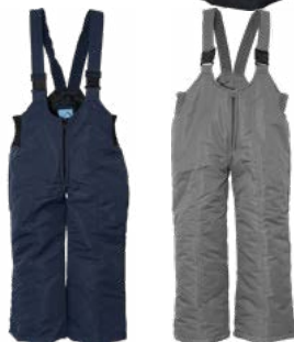
23-512-J YOUTH (8-18) 23-512-P KIDS (4-7) 23-512-T TODDLER (2-4T) 23-512-I INFANT (12M-24M)