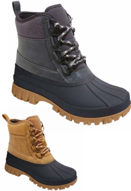
SNOW-DG-WB // Womens Boot SIZE (5-10) SNOW-DG-YB // Girls Boot SIZE (13-6)