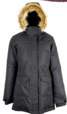
MCKINLEY 23-2242 INSULATED LONG PARKA