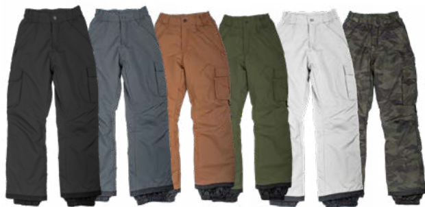
23-519-J YOUTH (8-18) 23-519-P KIDS (4-7) 23-519-T TODDLER (2-4T)