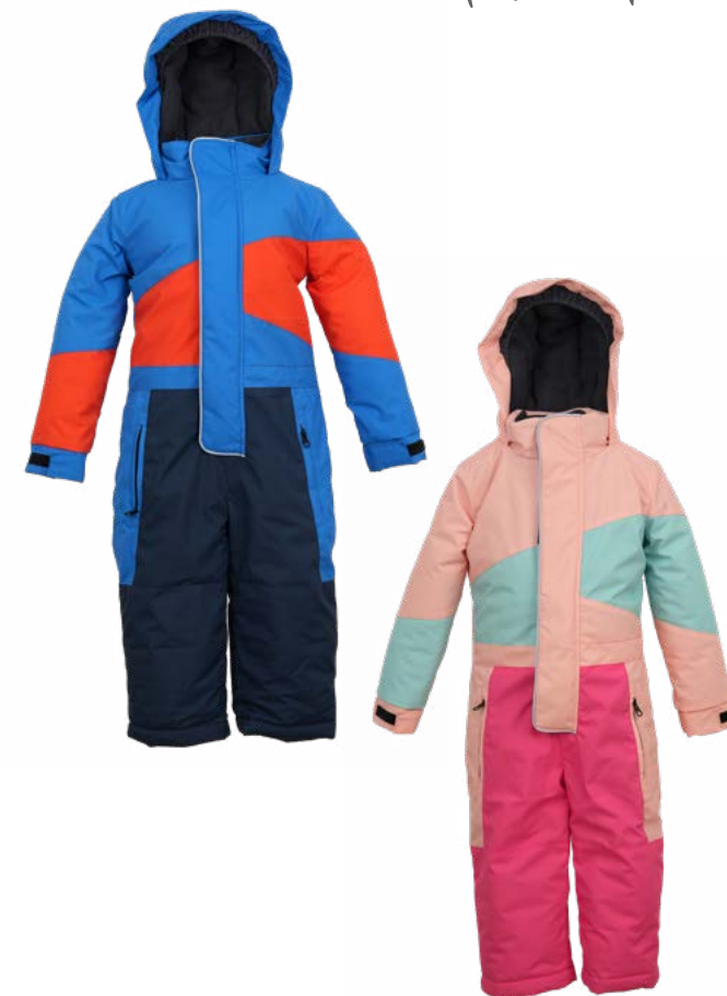
23-705-P KIDS (4-7) 23-705-T TODDLER (2-4T) 23-705-I INFANT (12M-24M)