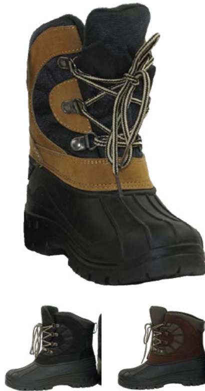
SNOWX-MB // Mens Boot SIZE (7-13) SNOWX-YB // Boys Boot SIZE (13-6)