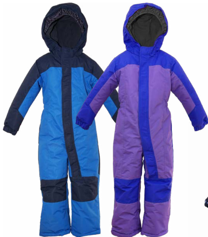
23-701-P KIDS (4-7) 23-701-T TODDLER (2-4T) 23-701-I INFANT (12M-24M)