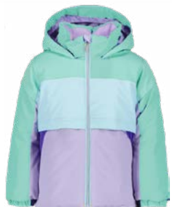
23-3204-J YOUTH (8-18) 23-3204-P KIDS (4-7) 23-3204-T TODDLER (2-4T)