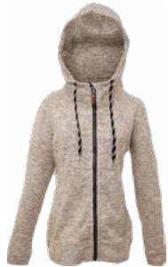
PALOMAR 23-2347 SWEATER FLEECE HOODED JACKET