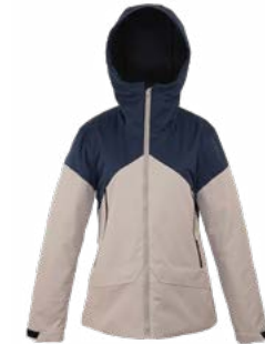
UPTOWN PARKA 23-2210 INSULATED MID LENGTH JACKET