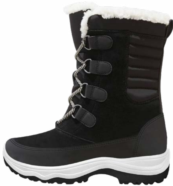
SNOW-WB-WB // Womens Boot SIZE (5-10) SNOW-WB-YB // Girls Boot SIZE (13-6)