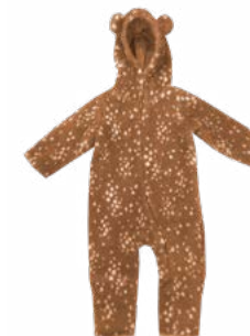
SNUGGLE FLEECE 1/4 23-3217-P KIDS (4-7) 23-3217-T TODDLER (2-4T)