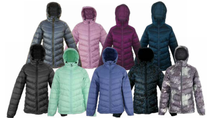
HOODED POWDERDOWN 23-2231-HD PACKABLE 90/10 DUCK DOWN JACKET