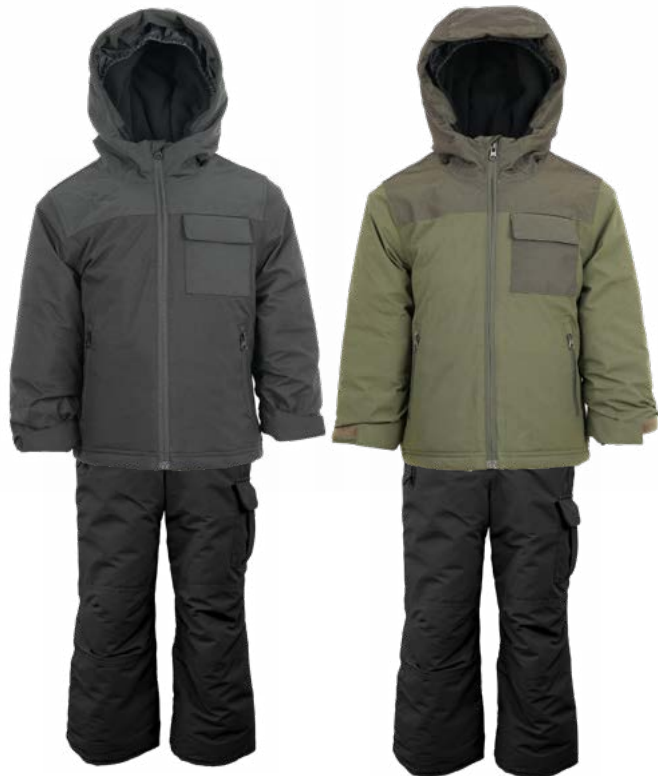
23-9403-P KIDS (4-7) 23-9403-T TODDLER (2-4T)