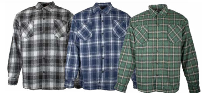
BRAWNY HOODED WFS-FSJ-JPT FLTJ-JPT FLEECE LINED FLANNEL