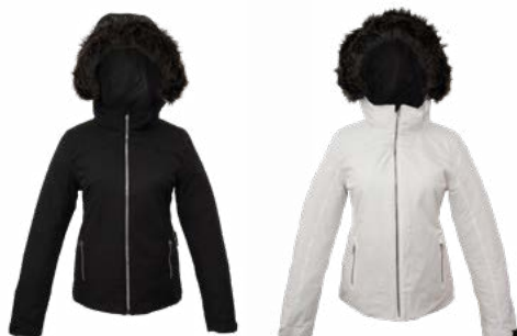
23-3201-J YOUTH (8-18) * 23-3201-P KIDS (4-7) 23-3201-T TODDLER (2-4T)