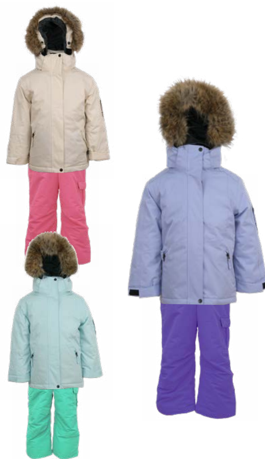
23-93209-P KIDS (4-7) 23-93209-T TODDLER (2-4T)