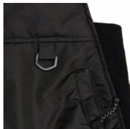
23-511-J YOUTH (8-18) 23-511-P KIDS (4-7) 23-511-T TODDLER (2-4T)