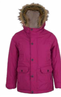
23-3203-J YOUTH (8-18) 23-3203-P KIDS (4-7) 23-3203-T TODDLER (2-4T)