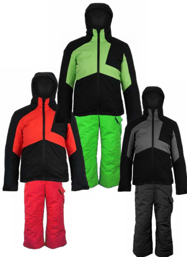
23-9404-P KIDS (4-7) 23-9404-T TODDLER (2-4T)