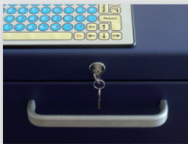
Easy to carry handle