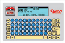
Integrated standard keyboard