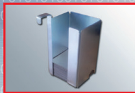
Interchangeable input hopper for multiple plates