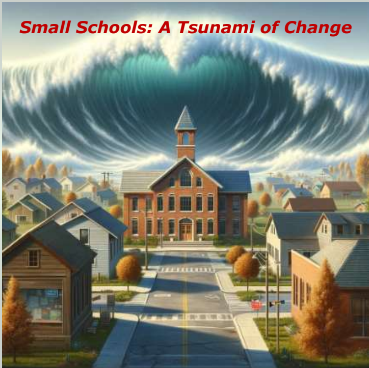
Small Schools: A Tsunami of Change

The Future Facing 21 st Century Graduates is Profoundly Different from 20 th Century Reality