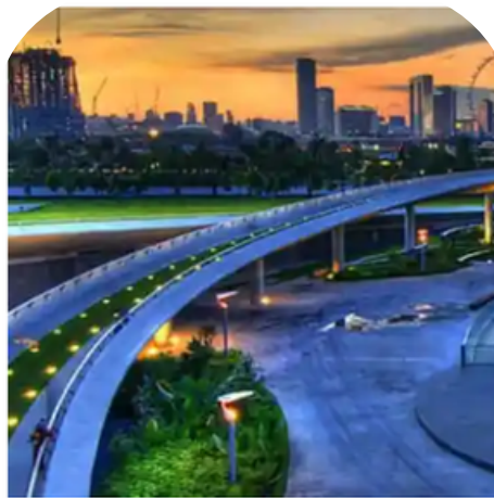
Manufacturing Unit- Greater Noida

Khasra no. 122 , Central Hope Town, Selaqui Industrial Area, Dehradun, Uttarakhand