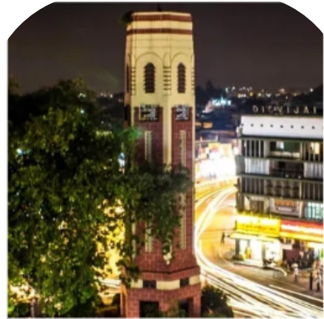
Manufacturing Unit- Dehradun

Khasra no. 122 , Central Hope Town, Selaqui Industrial Area, Dehradun, Uttarakhand