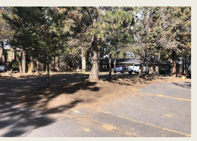
Juniper bushes BEFORE Juniper bushes AFTER