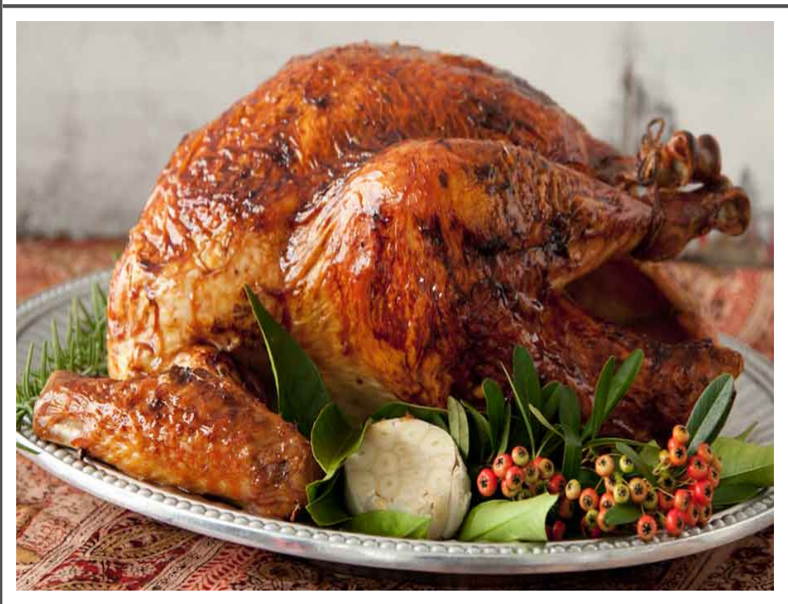
Silver Sage Annual Thanksgiving Feast Wednesday, November 20th 12pm

Cowboy Opry The monthly Cowboy Capital Opry is our most popular event held on the 1st Tuesday of every month. Artists donate their time and talents to benefit our Meals On Wheels.