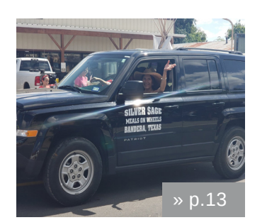
"Through The Eyes Of A Driver" by Mary Allyce

Silver Sage-803 Buck Creek Bandera, TX 78003 (830) 796-4969 P.O. Box 1416