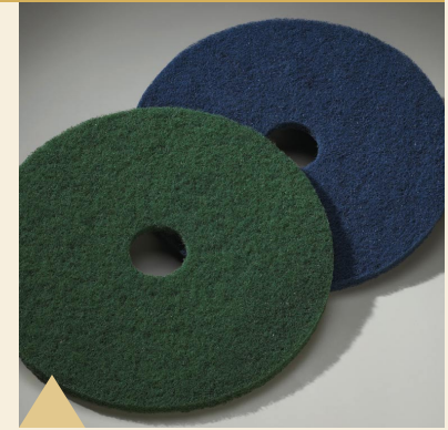
Green Super Scrub, Blue Super Clean