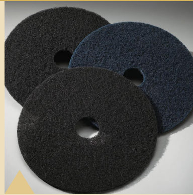
Ultra Blue Stripper, High Productivity Stripping, Black Super Strip