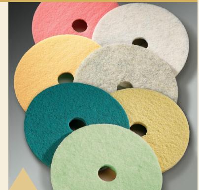
Champagne Polish & Burnish, Mint Soft Burnish, Aqua UHS, Thermal Burnish, Grizzly Bear Lite, Ultra Grizzly Bear, Pink "Topshine" Burnish