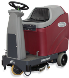
MAX Ride 20 Compact Rider Scrubber