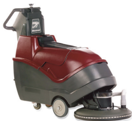
Lumina 20 Battery Burnisher