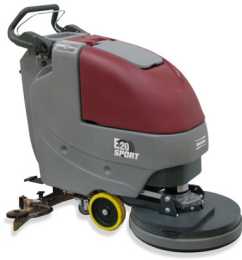
E17, E20, E20 Cylindrical Small Walk-behind Scrubbers