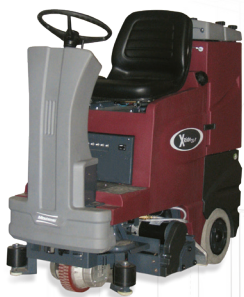
E Ride 26 Compact Rider scrubber

The SPORT technology (Scrub Polish or Remove Top Two Coats) – allows for an easily and economical means to perform chemical free surface preparation and or the removal of floor finish to effectively clean and restore floors.