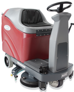
MAX Ride 26 Compact Rider Scrubber