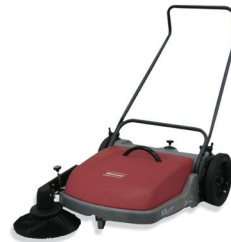
Kleen Sweep 27 Manual Walk-behind Sweeper