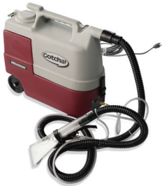
Gotcha! Carpet Spotter