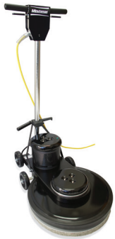
Mirage 1500/2000 Cord-electric Burnishers