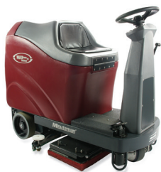
Max Ride 20 Orbital or Max Ride 28 Orbital Compact Orbital Rider Scrubber