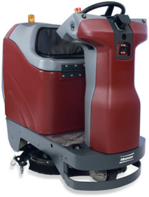
Robo Scrub Autonomous Rider Scrubber