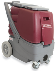
Rush Series Extractor Box extractors