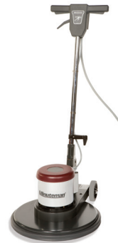
Frontrunner Series Floor Machines