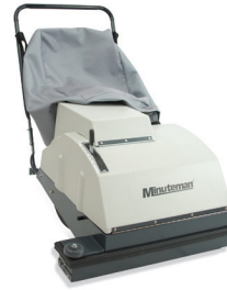
747 30" Wide Area Vacuum