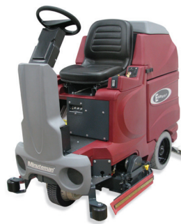
E Ride 32 Rider Scrubber