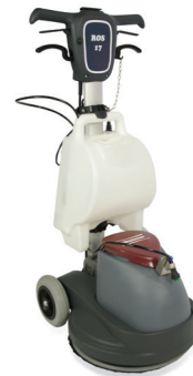
ROS 17 Orbital Floor Machine