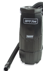
S10 Commercial Back Pack Vacuum