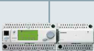
Control and switching unit for heating, ventilation and air conditioning plants

The world's only open standard for home and building control – ISO/IEC 14543-3