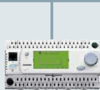
Central control unit and room controller for individual room climate