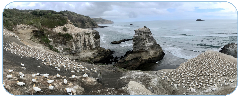
The Ōtakamiro Trail, Muriwai is a great spot to view gannets.

The nesting season here starts in October.