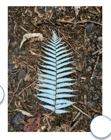
Silver Fern (lower side of the frond)