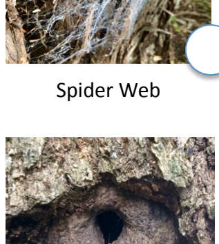
Puriri Caterpillar Hole