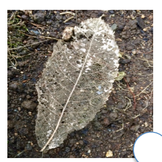
Mahoe Leaf Skeleton