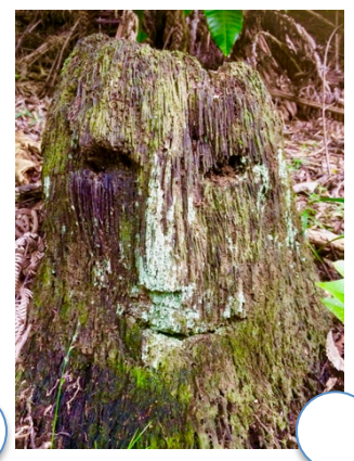
Smiley Tree Fern Stump (on Thatcher St track)