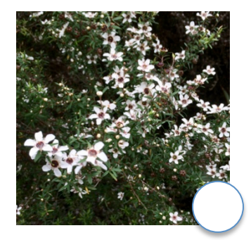
Manuka / Tea Tree