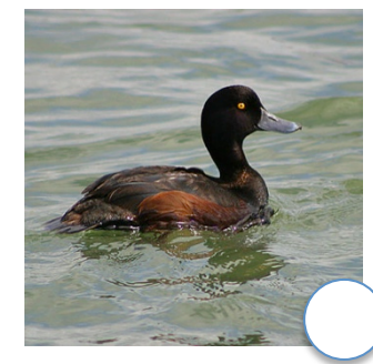
NZ Scaup / Diving Duck