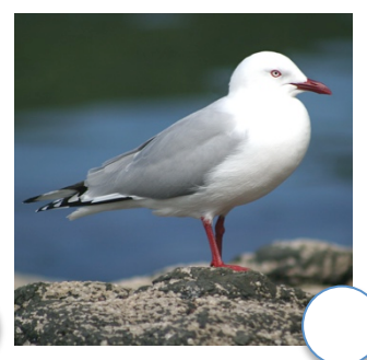
Various types of Gull