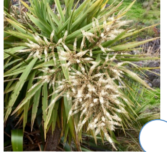
Ti kouka / Cabbage Tree