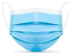
3 Ply Masks