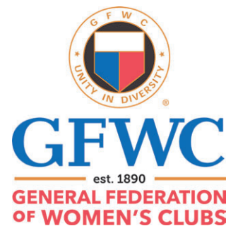
Vertical GFWC Emblem