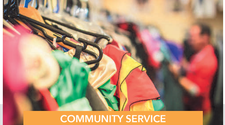
COMMUNITY SERVICE FOR THE ARTS

The GFWC Big Rapids, Inc. Club (MI) gathered around a large table to make Valentine's Day Cards. Members were asked to bring anything they had that could be used on the cards for decoration. A total of 183 cards were created and delivered to shut-in clients of the local "Meals on Wheels" program.