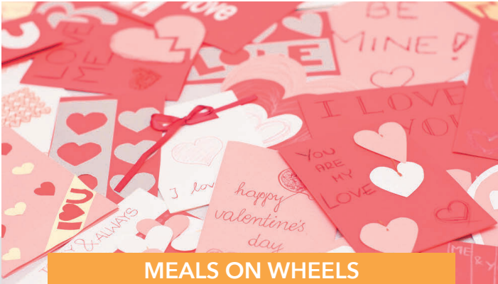
MEALS ON WHEELS VALENTINE CARDS

The GFWC Big Rapids, Inc. Club (MI) gathered around a large table to make Valentine's Day Cards. Members were asked to bring anything they had that could be used on the cards for decoration. A total of 183 cards were created and delivered to shut-in clients of the local "Meals on Wheels" program.