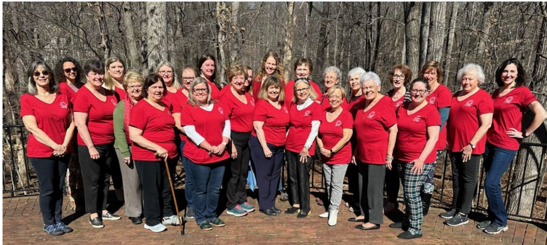
GFWC Virginia Midwinter Meeting 2023 Sweet Briar - Elston Inn Conference Center

Items collected by our GFWC Virginia General and Junior Boards and other Midwinter attendees for the Centra Forensic Services. Centra Forensic nurses serve the cities of Lynchburg, Bedford, and Danville and the counties of Amherst, Appomattox, Bedford, Campbell, Charlotte, Halifax, Nelson, Pittsylvania and Prince Edward.