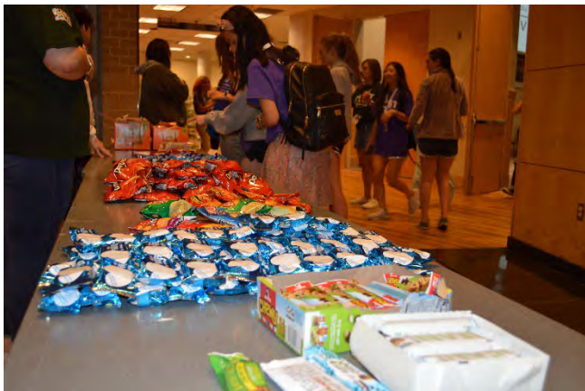
Snacks provided by GFWC Virginia were Extremely Popular

Planning has already begun for the 2024 Seminar. In October High School counselors in both public and private schools will receive registration information regarding the 2024 seminar. Did you know that a student can self-nominate to attend the seminar? Do you know a sophomore you might encourage to go to their counselor and apply, maybe even one of our Juniorette club members.