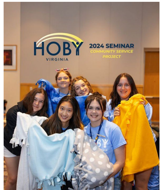
Attendees at the 2024 HOBY Leadership Seminar display blankets made for PROJECT LINUS as the 2024 Service Project

The total cost for a student's Seminar attendance is approximately $475.00, which includes a registration fee paid to HOBY International, which is the school's responsibility. The second cost is a $225.00 sponsorship that includes lodging, food, training materials and incidentals. Donations and sponsorships from GFWC Virginia Clubs fund these costs for the Leadership Seminar. These donations are sent via GFWC Virginia to HOBY Virginia.