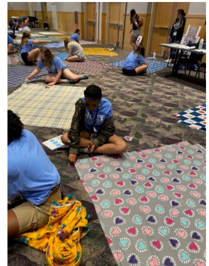
Ambassadors cut and thread blankets for Project

I have just returned from the annual HOBY Virginia Youth Leadership Seminar held on the campus of James Madison University May 31 st to June 2 nd and it was O U T S T A N D I N G!! The theme of this year’s seminar was “Agents of Change” . The Curriculum was based upon HOBY’s vision to motivate and empower individuals to make a positive difference within our global society. We welcomed 155 rising Juniors from across the Commonwealth representing all eight of our Districts . From the moment of arrival, ambassadors were immersed in teambuilding activities, leadership presentations, a service project, and motivational addresses from keynote speakers who were experts in their fields. Leadership through Service to others was emphasized and each Ambassador was challenged to return to their community and perform at least 100 hours of Community Service in the upcoming year. This year the Seminar Service Project was Project Linus, A service organization that provides handmade blankets to children who are seriously ill, traumatized, or otherwise in need. The Ambassadors made over 155 blankets to donate to this project. I am thrilled to report that through your generosity, almost ALL of the fleece needed to produce these blankets was DONATED by our GFWC Virginia Clubs!! Additionally, as in years past, the “snacks” were a huge hit with ambassadors and staff alike. Your administrative material and office supplies were also put to good use.