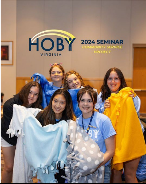
Ambassadors display the finished product

I was thrilled to witness the enthusiasm with which these ambassadors pursued their objectives, and how impressed I was with the energy level and camaraderie they displayed. Nationwide over 8500 student ambassadors will attend one of 70 seminars and will be supported by over 3000 volunteers, many of whom are alumni of previous sessions. Planning has already begun for the 2025 Seminar. In October High School counselors in both public and private schools will receive registration information regarding next year's seminar. Did you know that a student can self-nominate to attend the seminar? Do you know a sophomore you might encourage to go to their counselor and apply, maybe even one of our Juniorette club members.