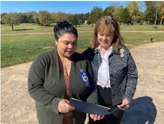
Glenn Youngkin Governor

Advocates for Children Week was October 23-29. This year, the focus was on collecting and donating personal hygiene items, clothing, and blankets to local organizations for children removed from homes due to unsafe conditions. If you have pictures of your events held that week, please share them! Also, remember to write it all down as reporting is just around the corner. Our efforts were recognized by Governor Glenn Youngkin, as he sent a letter of thanking GFWC Virginia for our work in the Commonwealth. The letter, sent in honor of Advocates for Children Week, cites our efforts focusing on the well-being of children and our dedication to community service. Ladies, we have much to be proud of!