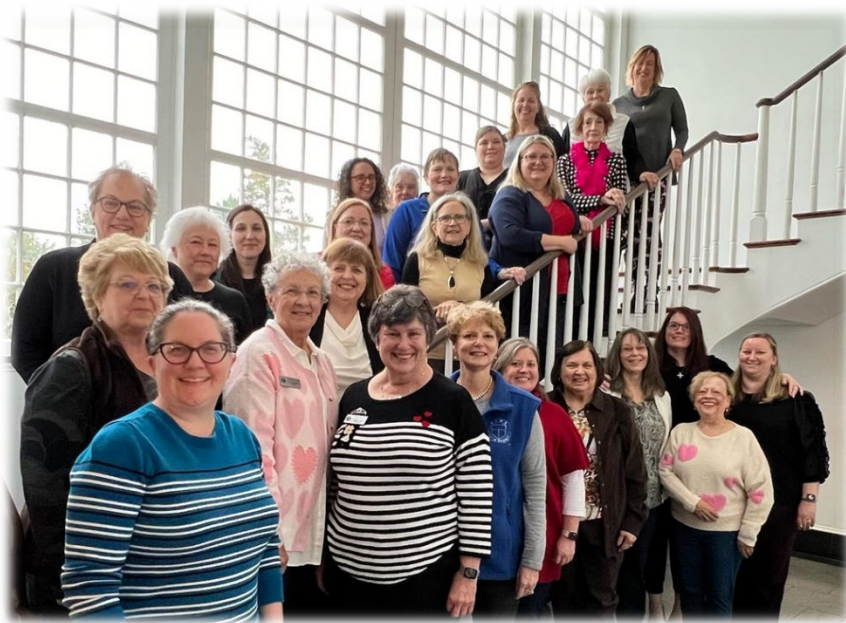
GFWC Virginia Midwinter Meeting 2024 Berry Hill Resort South Boston, Virginia

We are looking forward to Spring and another busy and successful year in Tidewater District.