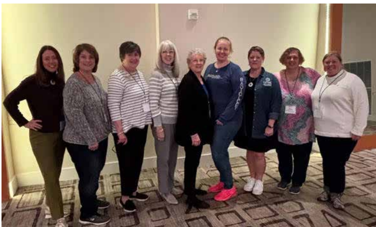
GFWC Virginia participants at GFWC Leadership Conference at Headquarters in Washington, D.C.