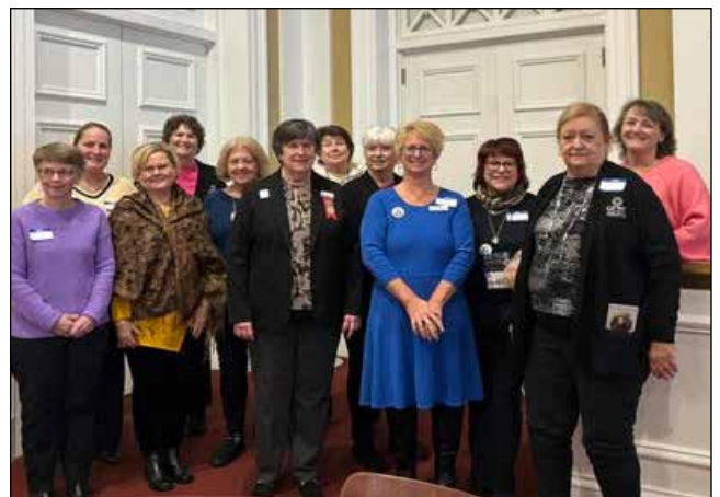
Tidewater District ladies at Legislation Day