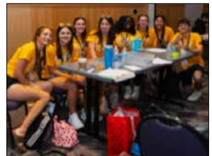
Junior Staff volunteers prepare for arrival of Ambassadors.

Wow!! This year’s HOBY Virginia Seminar was O U T S T A N D I N G!! Held May 29th – May 31st on the campus of James Madison University, the event gave me the opportunity to witness the excitement and camaraderie displayed by the 168 Ambassadors in attendance. The theme of this year’s seminar was “Lights, Camera, LEAD. The Seminar’s Curriculum is based on HOBY’s vision of motivating and empowering future leaders in our global society. From the moment of arrival, ambassadors were immersed in teambuilding activities, leadership presentations, a service project, and motivational addresses from keynote speakers. This year, the Seminar Service Project supported “Still Meadows Enrichment Center and Camp”, a camp in Virginia’s Shenandoah Valley supporting children and adults