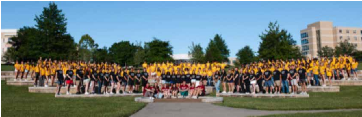
2026 Ambassadors, Junior, and Senior Staff Gather for a Picture

It is wonderful to be affiliated with HOBY and to observe the enthusiasm of the ambassadors and the dedication of the alumni who volunteer each year to conduct the Seminars. If you have questions, please do not hesitate to contact me for additional information. As always, HOBY Virginia is grateful to the ladies of GFWC Virginia for their generosity and support of the Leadership seminars and our ambassadors.