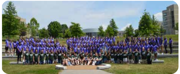
HOBY Seminar Ambassadors, Counselors, and Directors on the Campus of James Madison University

Again, this year, the annual HOBY Virginia Youth Leadership Seminar will be held on the campus of James Madison University from May 30–June 1, 2025. Planning for this event is well underway and HOBY Virginia looks forward to welcoming rising Juniors from across the Commonwealth. GFWC Virginia Clubs from all eight Districts supported HOBY Ambassadors in 2024.