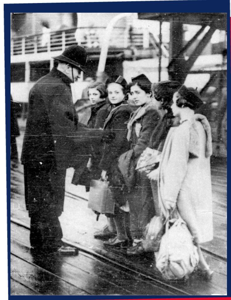
London, UK, 1938, Jewish children arriving in the city