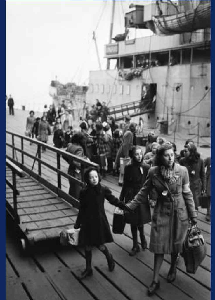
Dutch Children arrive in Essex, 1945

Lesson Title: Refugees, Migrants and “Stateless” Peoples’ - People’s ‘Routes’ to Britain