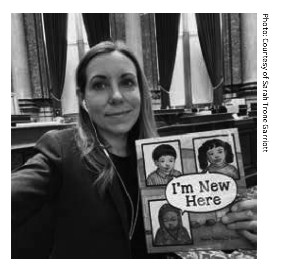
"IT'S REALLY GOOD TO HAVE THOSE EXPERIENCES OF SEEING LIFE FROM A DIFFERENT PERSPECTIVE, BEING A LITTLE UNCOMFORTABLE."