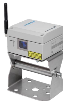
Fig. 5: LaserTilt90 mounted on a swivel mounting bracket LS-ACC-LAS-SB that includes the attachment option of a convergence bolt with a G3/8" male thread.