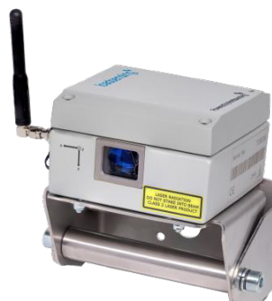
Fig. 3: LaserTilt90 mounted on a swivel mounting bracket WS-ACC-LAS-NSB on a vertical surface.

10 The kit of 3 magnets can be used to fix the LS-ACC-IN15-VP mounting plate.