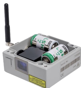
Fig. 2: Inside view of the LaserTilt90.

7 The laser beam cannot be aimed using this mounting plate because the node is fixed.