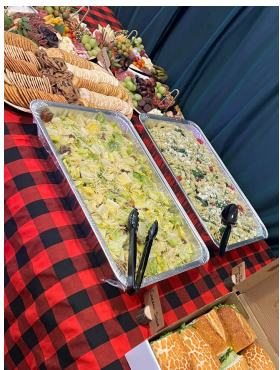
Sandwiches, Salads, & Charcuterie Boards