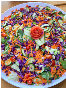
Traditional Garden Salad