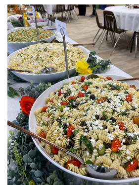
Cold Pasta Salads