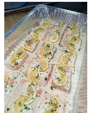
Lemon Butter Salmon