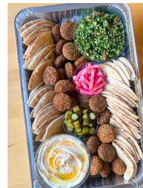
Middle Eastern Platter