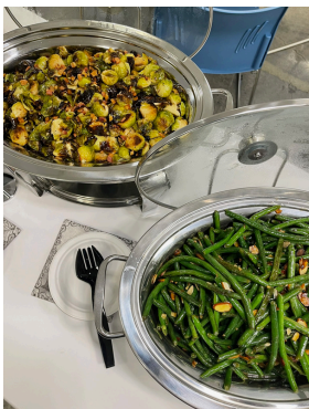
Green Beans w/ Almonds & Brussel Sprouts w/ Pancetta