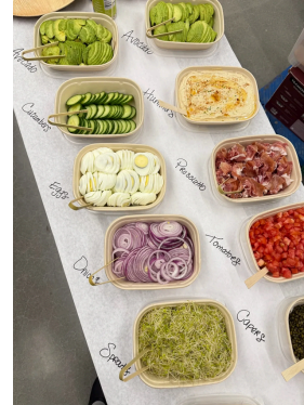
Avocado Toast Bar