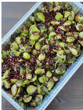
Brussel Sprouts with Pancetta