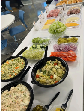
Sandwich Bar w/ Assorted Salads