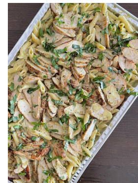
Pesto Pasta with Chicken