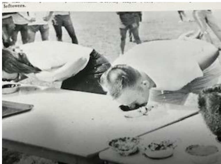
Freshmen learn to eat pies