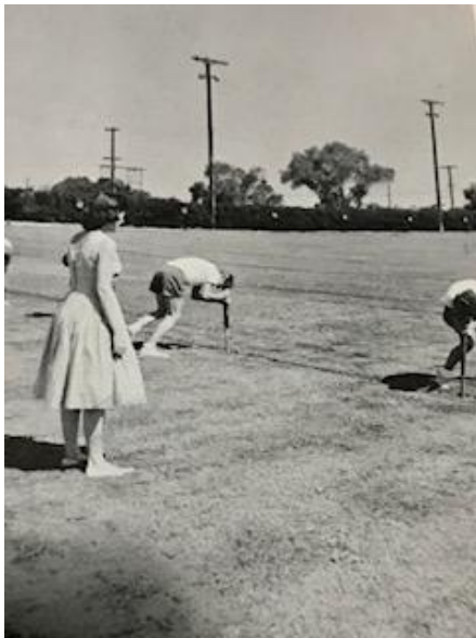
Izzy Dizzy Race

events changed to events that everyone could succeed in such as the pie-eating contest, egg toss, Izzy Dizzy races, cotton bale rolling contest, tug of war, etc. Field Day promoted class spirit and allowed everyone some time to enjoy a fun day out on the football field. When PHS was small it was easy to organize and control. When the school grew so much in the 70s and 80s it was discontinued because there were just too many students to keep track of and their interest waivered.