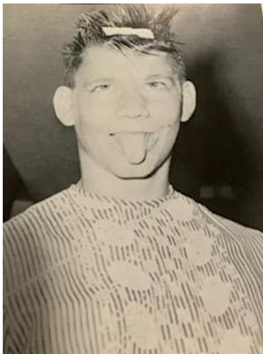
Freshman dressed up for initiation

When the school was small from the 20s to the 60s it was a time to initiate the freshmen into high school. Activities included dressing up in crazy costumes such as wearing your clothes inside out, wearing crazy hats, and having crazy hair arrangements. The freshmen had to do favors for upper-classmen and participate in a school-wide assembly. Again this ended in the 80s when the word hazing became prevalent in court cases across the country. Small schools allow for more school activities and school spirit.